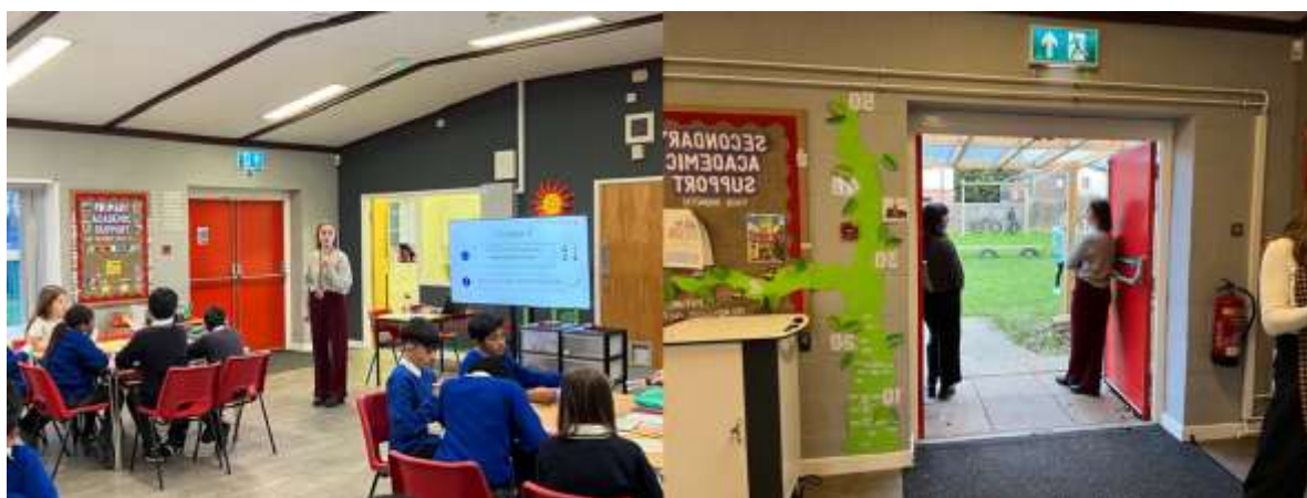
IntoUniversity, Peterborough Centre

CCC continues to support the funding of the IntoUniversity Peterborough Centre. The centre offers an innovative programme that supports children from grade 3 all the way through to university. During the year it supported over 144 students including 121 through academic support. Primary students explored exciting career paths in engineering, psychology and history of art, while boosting literacy and numeracy through curriculum linked activities. Year 6 had a focus week on World War II. They visited the Peterborough Museum where they examined real artefacts in an air-raid shelter, and capped it off with a mini graduation at the Anglia Ruskin University, showcasing the knowledge they had developed over the week.