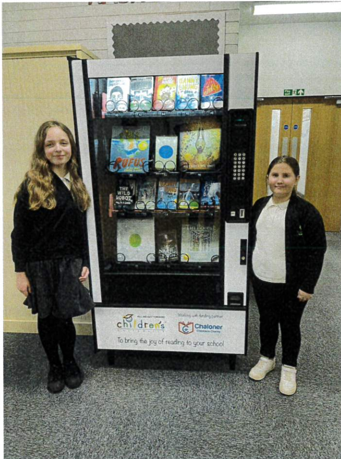
Book vending machines promoting literacy and a love of books!

The three-year literacy programme which CCC undertook in partnership with the Hull and East Yorkshire Children's University was completed during the year. A total of 30 book vending machines have been installed in primary schools in areas where there is high deprivation and where some of the most disadvantaged schools do not have their own library. The teachers have been very enthusiastic about the programme, and we understand there has been a marked increase in children reading as well as improved literacy rates.