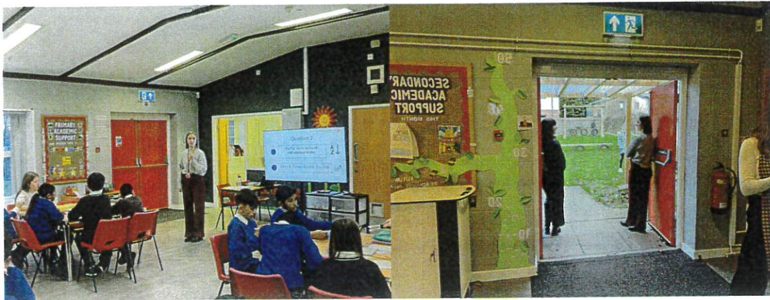
IntoUniversity, Peterborough Centre

CCC continues to support the IntoUniversity Peterborough Centre. The centre offers children growing up in underprivileged neighbourhoods a safe place to learn, and encouragement to aspire and succeed. The programme includes after school academic support, sessions helping young people with their homework, and one-to-one mentoring opportunities with university students or corporate volunteers. Students are supported from the age of 7 all the way through to university. Anglia Ruskin recently opened a new university campus in Peterborough and students from the centre will be well placed to go on to university.