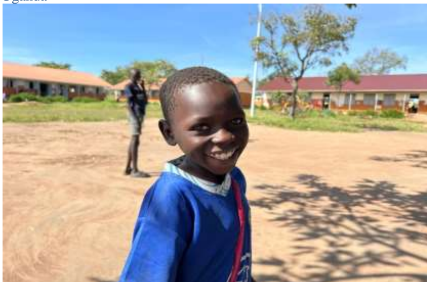
Young student in front of Progressive Primary School, Palabek, Uganda

In 2024 CCC constructed three new classrooms at the Bright Future Primary School in the Palabek refugee camp. This helped reduce the student to classroom ratio although many of the children are still being taught under trees. This is the third largest school in the camp and one of the most overcrowded. We are hoping to expand our work here, with the goal of eventually getting it registered as a government school. However, the overriding concern at the moment is reduction in food supplies in the settlement. The World Food Programme, which relies heavily on US funding, has significantly cut its support for refugees. Consequently, we are seeing a decline in school attendance because children are going hungry. Some parents are taking their children out of school to work in the community gardens to get increased household income to pay for food. We are working with our NGO on the ground to see if we can support our school communities in growing their own crops so they can feed their children at least one meal a day.