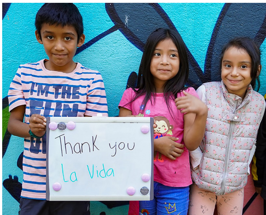
Education for the Children Foundation, Guatemala

In March, our annual fundraising event – Salsa Frenzy – contributed £15,000 to our funds.