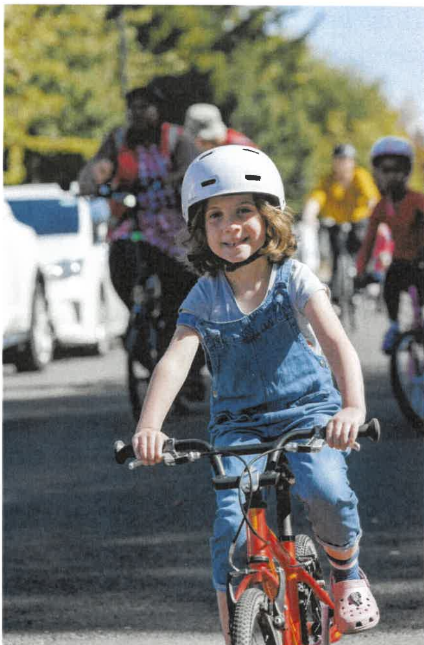
Taken at an LCC Haringey family ride, September 2024.