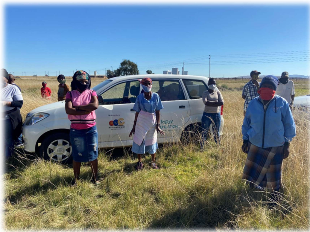
Emergency Covid-19 food parcel delivery, physically distanced residents.