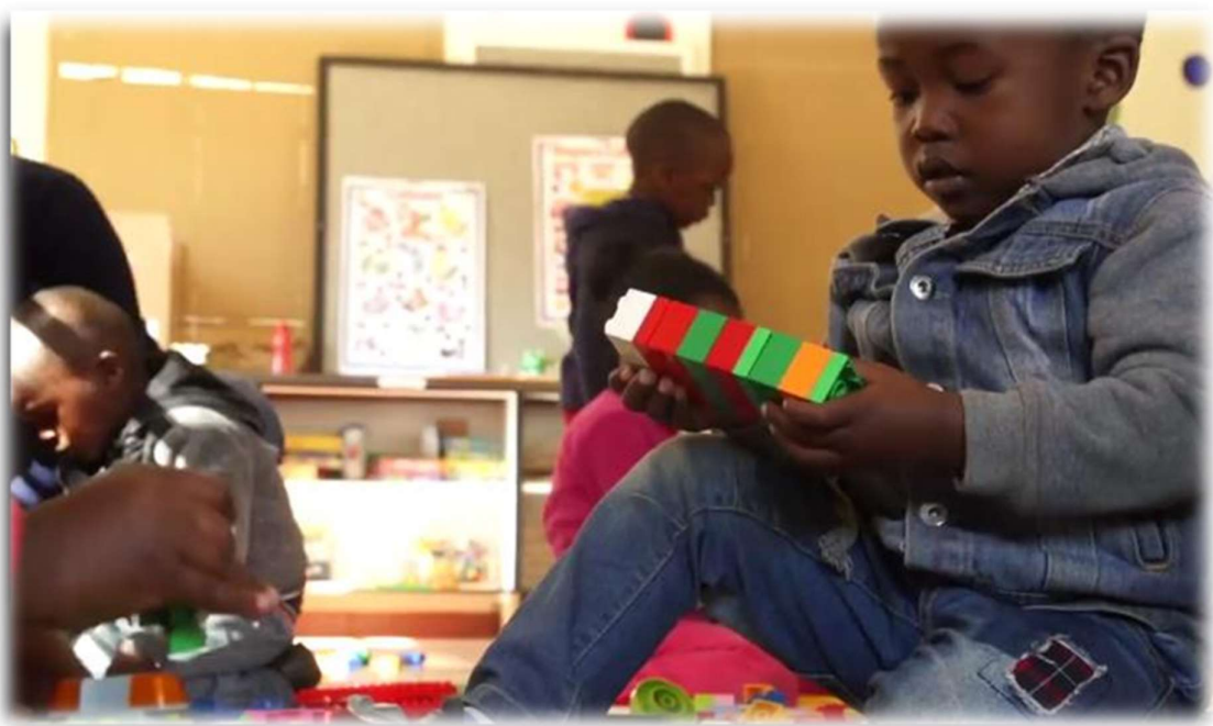
At one of the ECD centres