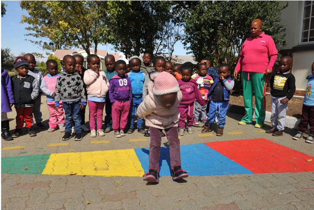
At Topsy SA's main, Grootvlei, centre