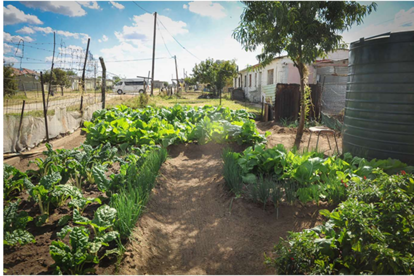
A resident's garden near Topsy centre in Grootvlei