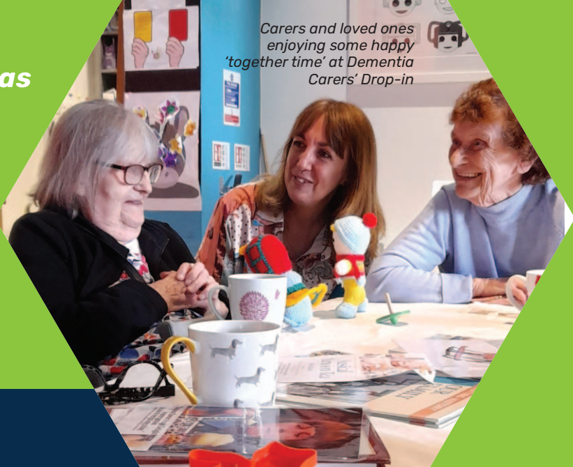
Carers and loved ones enjoying some happy 'together time' at Dementia Carers' Drop-in