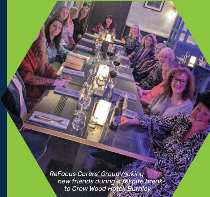
ReFocus Carers' Group making new friends during a respite break to Crow Wood Hotel, Burnley