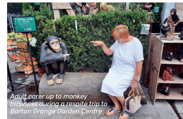
Adult carer up to monkey business during a respite trip to Barton Grange Garden Centre

Our achievements are the result of a collaborative effort. Our dedicated staff, volunteers, and Trustees work tirelessly to ensure that every carer who comes to us receives the support they need and deserve. Together, we are making a meaningful impact on the lives of carers in Blackpool.