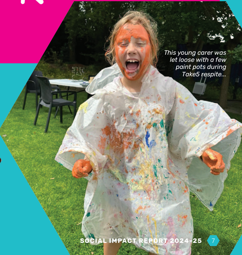
This young carer was let loose with a few paint pots during Take5 respite...

221 welfare checks made for young carers