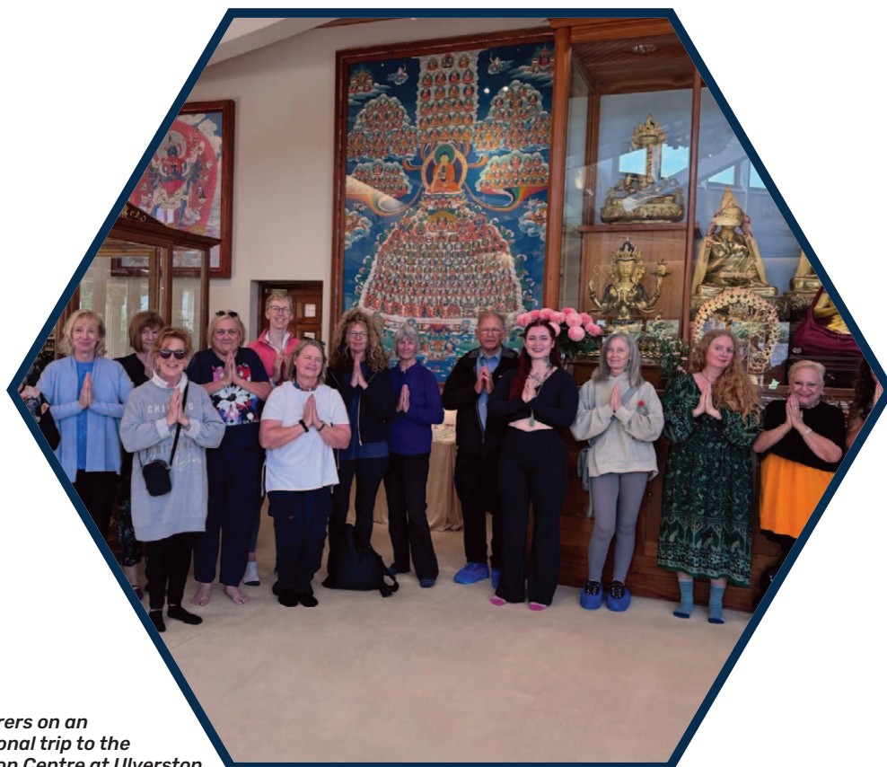
Adult carers on an inspirational trip to the Meditation Centre at Ulverston.