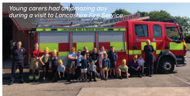
Young carers had an amazing day during a visit to Lancashire Fire Service