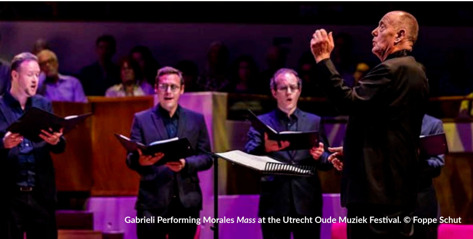
Gabrieli Performing Morales Mass at the Utrecht Oude Muziek Festival.