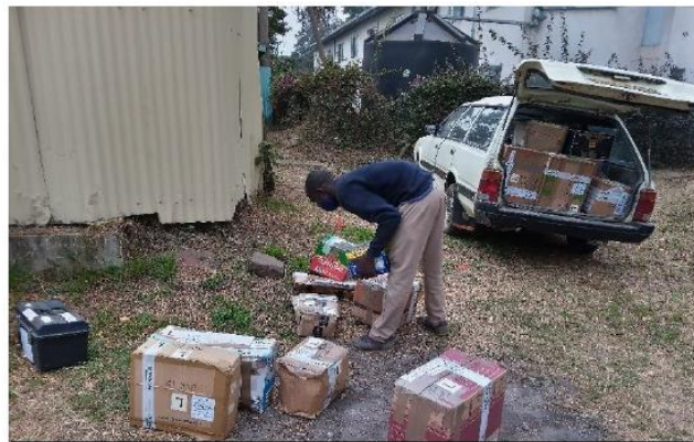
Inspecting Workaid UK machines for Korogocho women vocational training

The vocational centre was disrupted by COVID, and they hope to reopen this in January 2021.