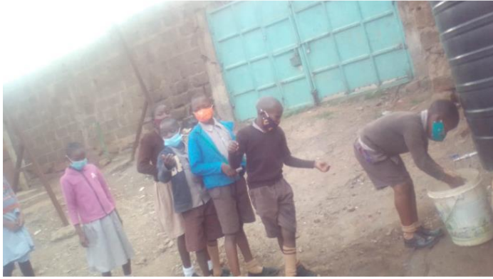
1 Children washing their hands before class session