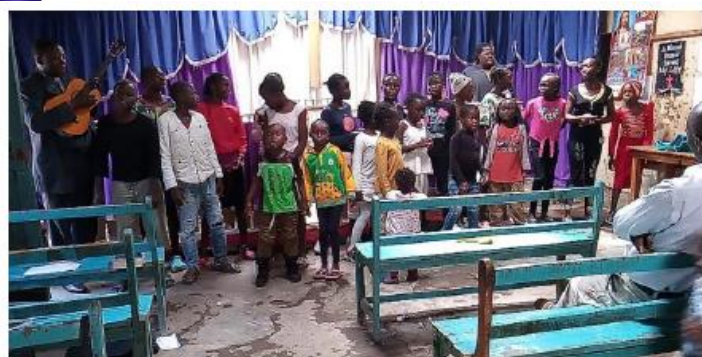
Orphans doing a presentation at VPM church

The church is also blessed to have talented youth giffen in playing musical instruments, who also have a vision for starting a band to take the Christian message out.