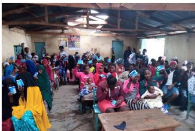
Women and girls getting pads at VPM

This is the arm of VPM that seeks to empower women of the Korogocho slums with skills for employments or self-employment. Courses offered include Tailoring/Dressmaking, Embroidery and Knitting.