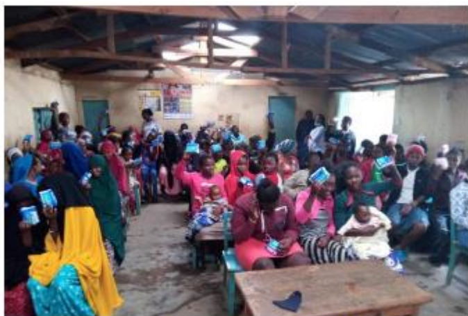
Women and girls getting pads at VPM

This year, there was also a new project to help local girls and women. “The vulnerable women pads project” has been set up to allow girls in need of sanitary pads to seek help from VPM. COVID-19 once again has hit this area with many women unable to earn money and buy the necessities. Some women previously had to resort to sex working to purchase sanitary products. VPM started this projects and counsel them,