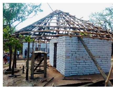
(left to right) Weluzani, paralysed wants to do vocational training; assembling fuel saving ovens; building the adobe earth-built entrance buildings.