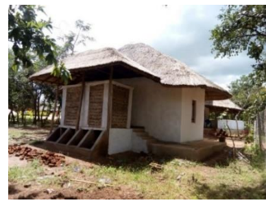
Finished entrance buildings with Guards room, showroom, trainee support room and compost toilets