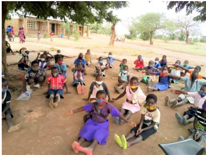
Children back at school during Covid-19 need to wear masks