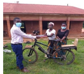
Disability outreach programme and training for new Bicycle Ambulances