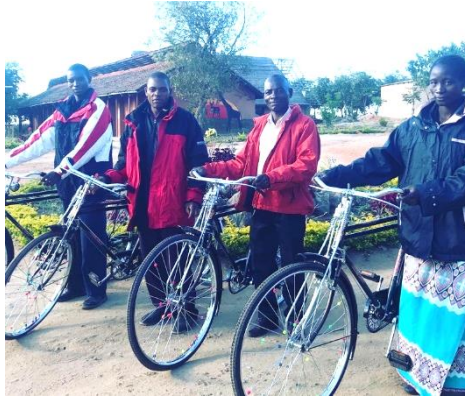
Our LBC Co-ordinators