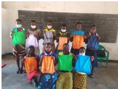
Girls getting sanitary packs