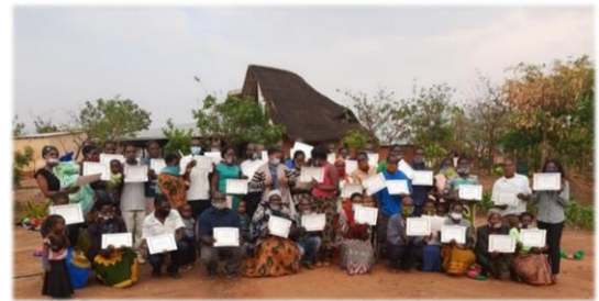
ECD Caregiver refresher training in Oct 2020