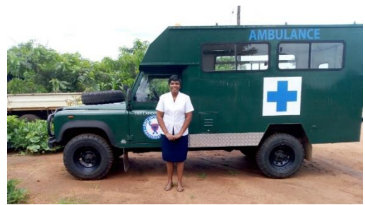
Medical Outreach programme using the new ambulance