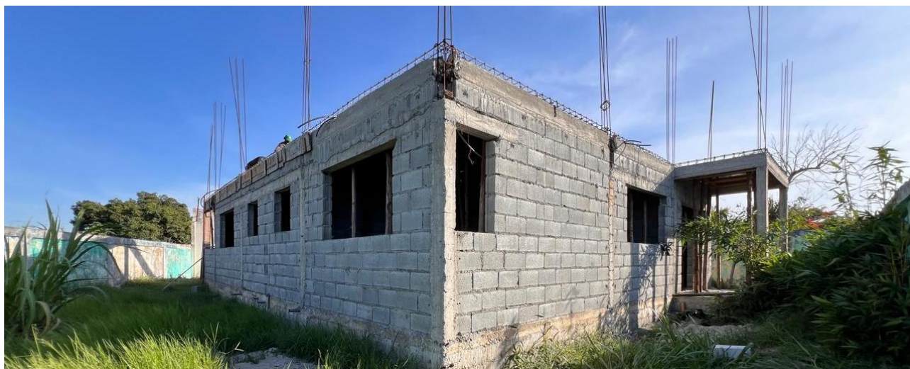
Completion of ground floor structure

During 2024 the ground floor of the new Staff Accommodation at Casa Reom took shape rising from the foundations completed the previous year. Structural pillars, capable of holding the upper floor, were erected around the walls of the ground floor rooms and lintels were added to create window openings throughout the building.