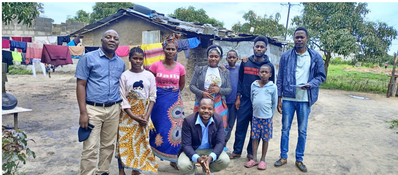
Re-integration visits to relatives of the boys

By 19 September there were 13/14 boys living at Inhamizua and Casa Reom. Staff members Boniface and Nelio have been working on a reintegration programme. 5 boys who have families and are in the process of reintegration were identified. This has involved visits to the families, dialogue with them, feasibility assessments, monitoring of the programme and collaboration with relevant authorities. Social Services partly supported this work but also request fees for their work from Casa Reom.