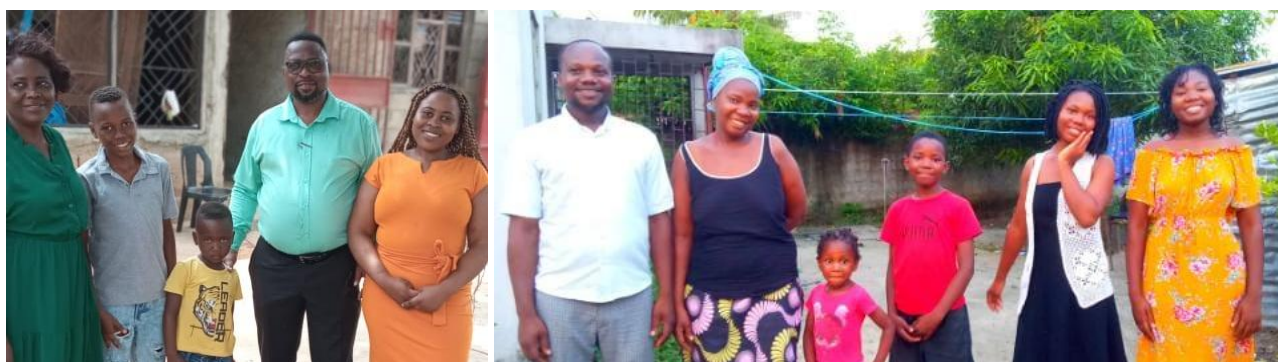
Casa Reom leaders and their families