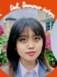
2nd Programme Lead, July 14