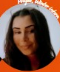
Project Director, July 14