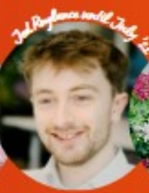
3rd Programme Lead, July 14