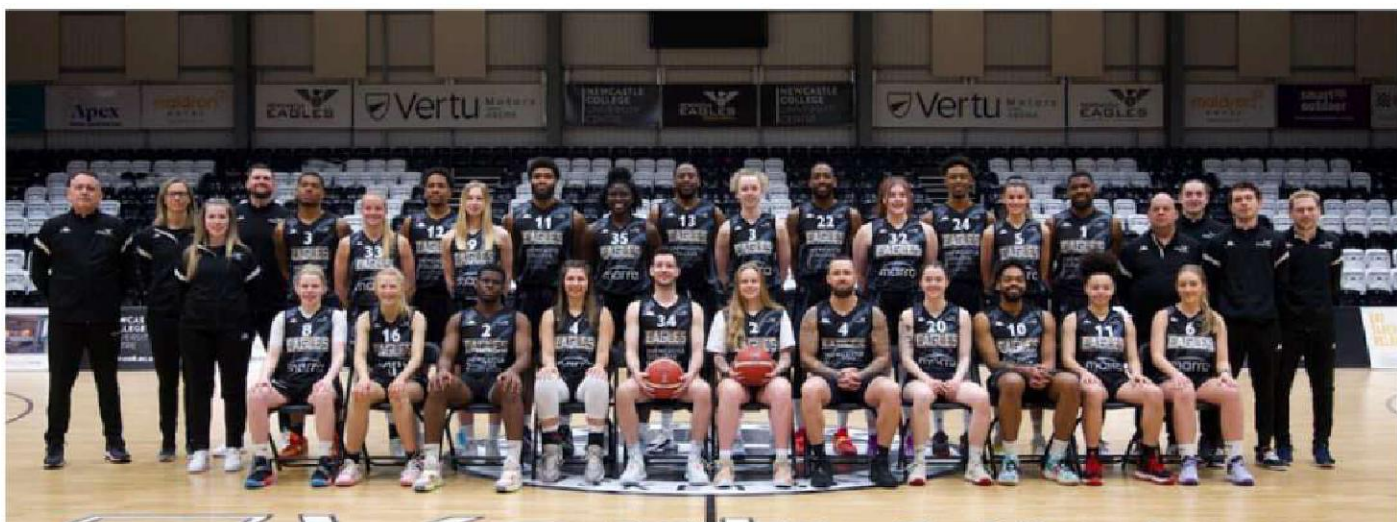
2022-23 NEWCASTLE EAGLES BBL & WBBL TEAMS