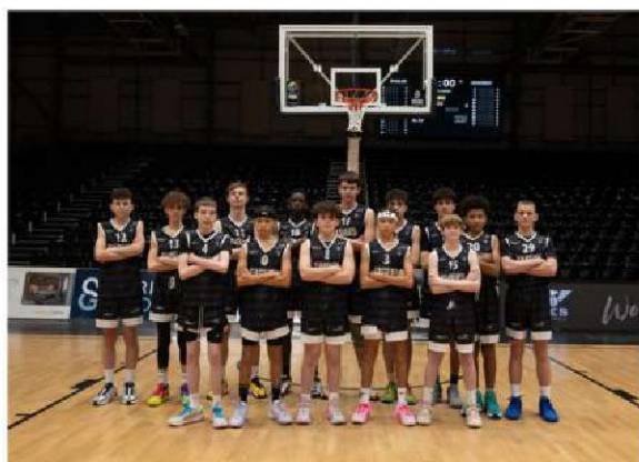
UNDER 14 BOYS