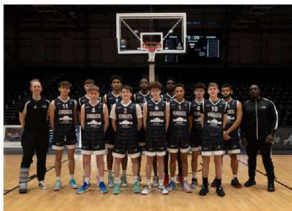
UNDER 16 BOYS