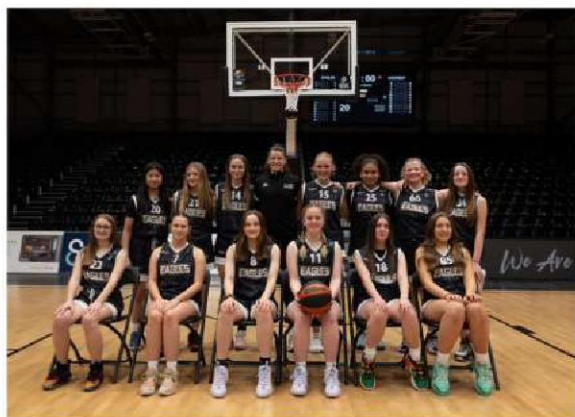
UNDER 14 GIRLS