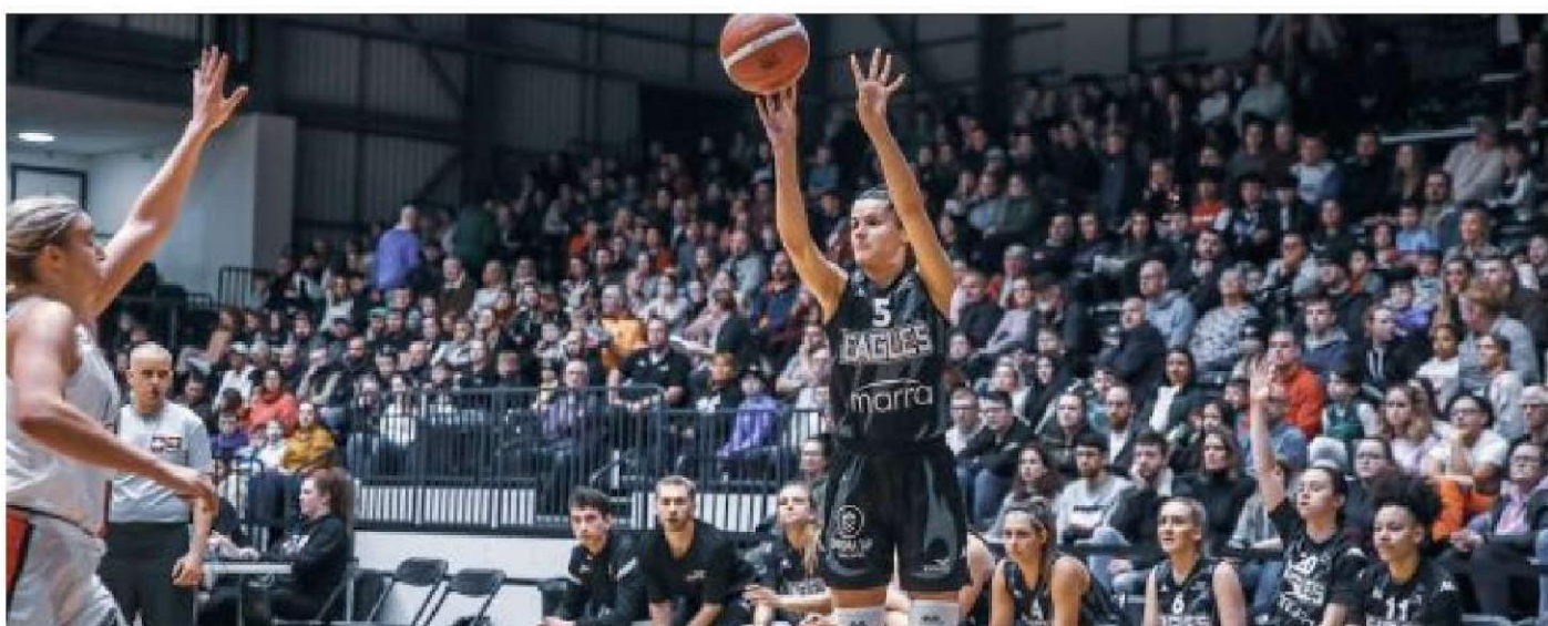
ANOTHER RECORD-BREAKING ATTENDANCE AT A WOMEN'S BRITISH BASKETBALL LEAGUE GAME