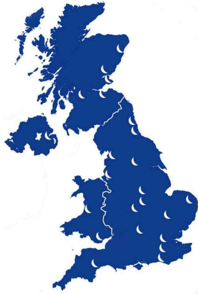
Nightlines across the UK in 2024-25

In 2024/25, the Nightline Association supported 26 Nightlines across the UK. We supported the setup of new Nightlines, such as Robert Gordon University and Aberdeen, provided subject-specific training for Nightlines, and held four conferences where over 130 delegates from Nightlines were able to meet, share ideas and receive updates on training. As with each of our ambitions in this period, we are extremely proud of all that was achieved, whilst also recognising that it is significantly less than we had hoped for.