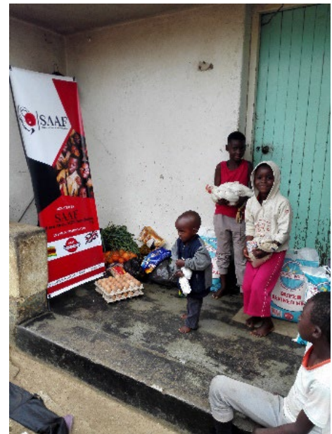
SAAF Food Hamper distribution