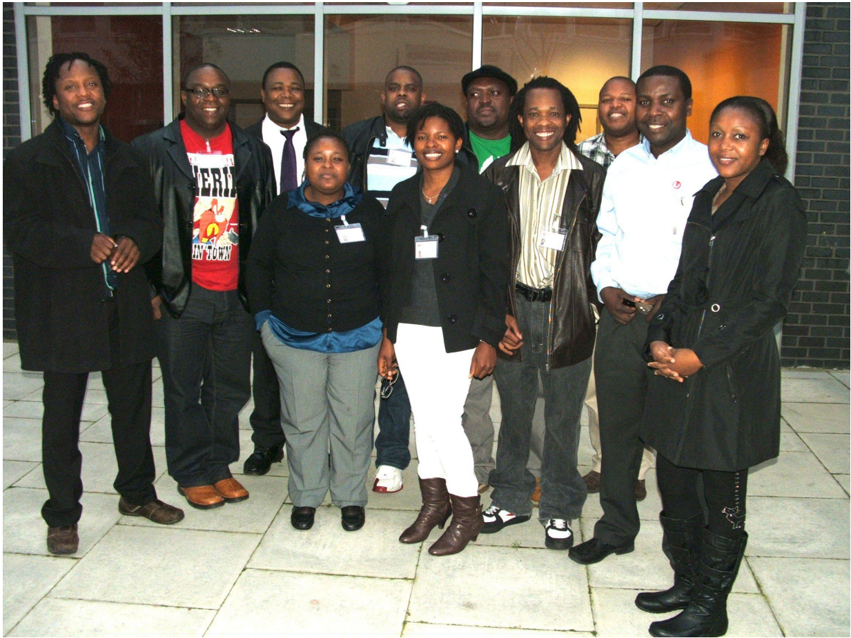
SAAF Trustees and Regional Chairpersons 2012