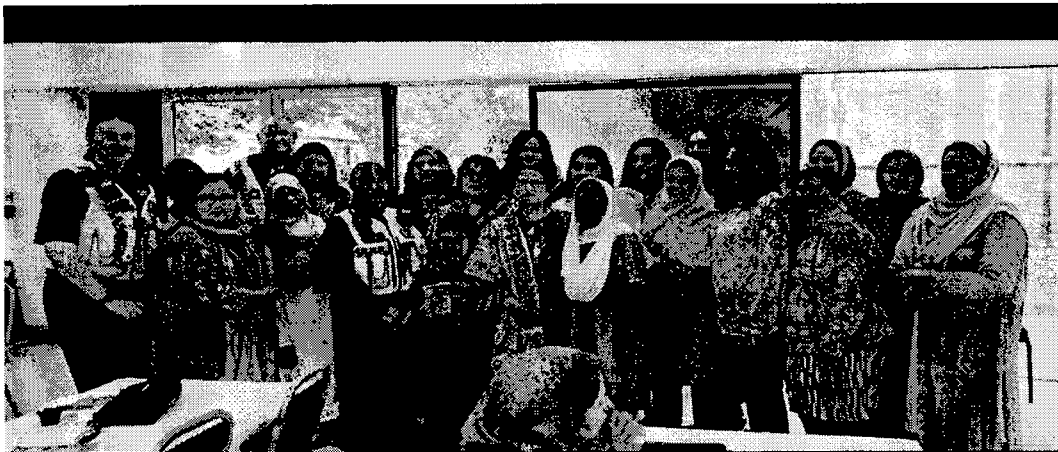
Khush amdid tackles taboo topics , this session on domestic abuse attended by women and men. Giving vital information about the different types and how to report it.