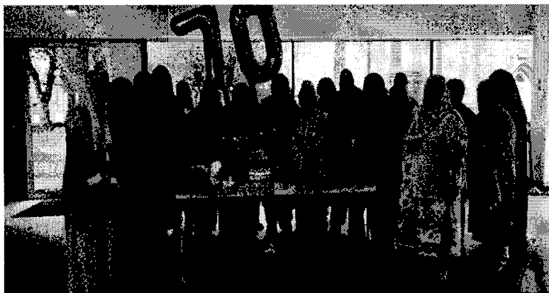
Khush amdid ensures no women feel they are not part of a family by celebrating their special bithdays as a family alleviating isolation and loneliness providing happiness and mental wellbeing