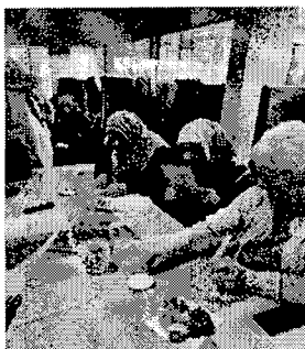
Khush Amdid volunteers organised activities enabling diverse communities to make Christmas cards together.