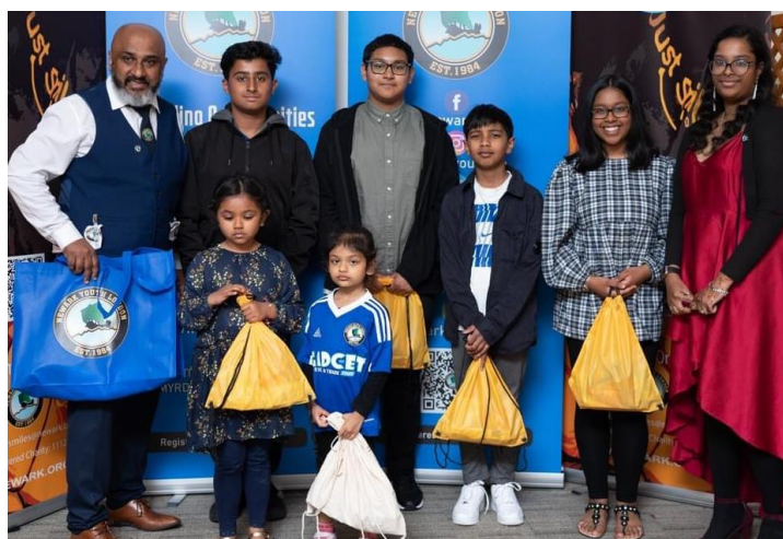
Children at the Annual Awards Ceremony

We delivered our annual awards ceremony for 400 children and their parents in November 2022. This allowed us to celebrate and recognise the achievements of the children, young people and volunteers and to encourage others to do the same in the future.