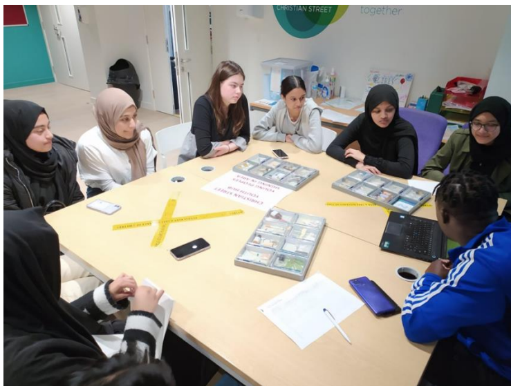
Substance misuse workshop for girls

The young people said, “Able to live a weekend without parents and parental rules, and not have my mum do everything for me - gain a sense of independence”, and “Residential put me out of my comfort zone and enabled me to work with all people from different backgrounds.”