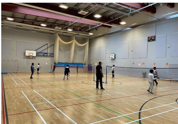
Father & Son badminton session

The aim of the project is to support inactive children, young people and adults to become active and improve their health and wellbeing. We run a wide range of activities including multi-sports and fitness for mothers and daughters, badminton for fathers and sons, women's walking groups, yoga and coffee mornings for over 50's and football sessions for people with a disability. We registered 273 new children, young people and adults, of whom 242 were previously inactive. We delivered 234 sessions, totalling 448 hours of delivery. Overall, we worked with 431 beneficiaries during the year and 338 attended 5 or more sessions.