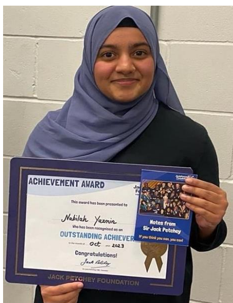
Recent Jack Petchey Achievement Award Winner

Newark Youth London is enrolled on the Jack Petchey Achievement Award scheme and every year 9 young people are awarded £300 each to spend on their peers and for their youth clubs/football teams. The awards are designed to motivate and encourage young people to be positive and take responsibility for their action and behaviour.