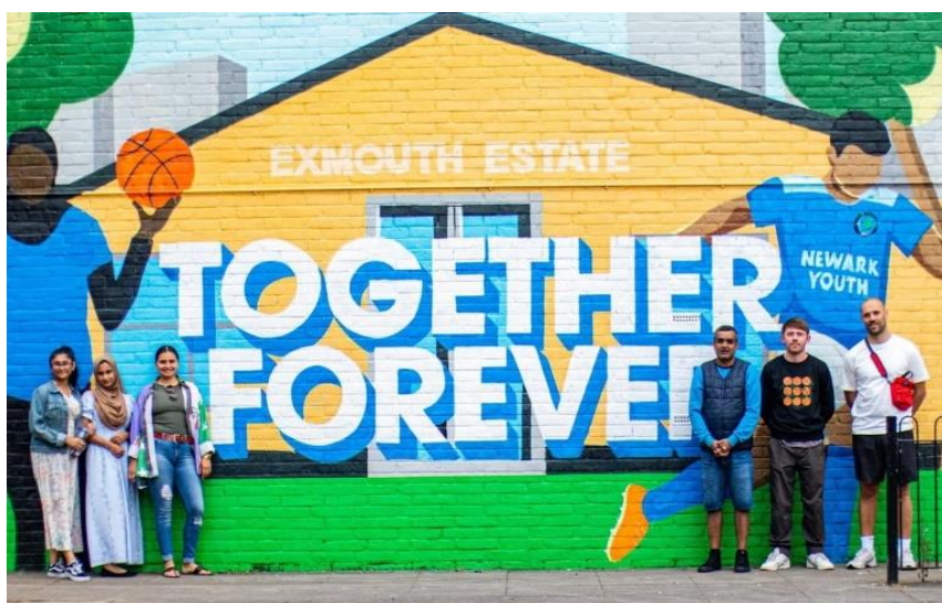
Mural on the Exmouth estate

In June 2022, we celebrated the Platinum Jubilee of Queen Elizabeth II with our Lovely Jubbly Festival at the Exmouth estate, which included a project led by the young people to develop a new outdoor wall mural for the estate. The event was a great opportunity to bring all parts of the community together and celebrate the achievements of our young people.