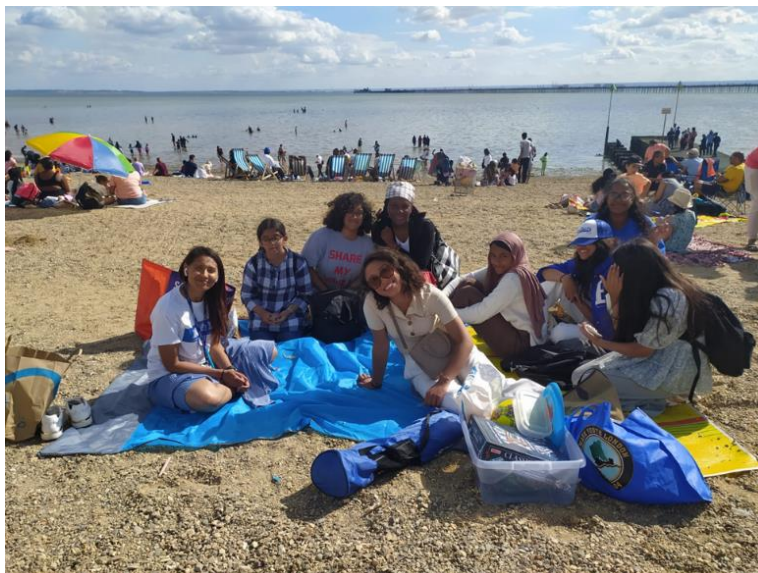
Day trip to the seaside