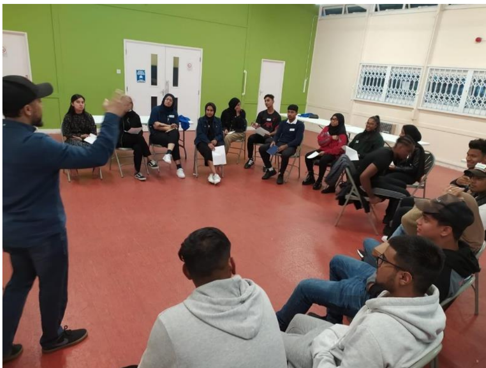
Young people on Healthy Relationship workshop

"I was just aiming to get it done and dusted with but didn't realise how important the information is. Workshop extremely important and useful. This helped me personally with relationships I have with everyone."