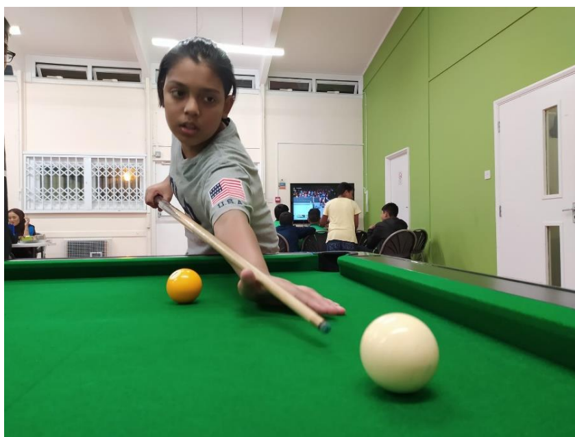
Participant in our Locksley Youth Club

We delivered workshops on Substance Misuse, Online Safety, Stop & Search, Violence Against Women and Girls, Hate Crime, Healthy & Unhealthy Relationships, Healthy Eating & Lifestyle, Mental Health, CV-Writing, Job Applications & Interview Skills and many more. Young people completed practical cooking sessions and took part in International Women's Week and the Queen's Jubilee celebration. We delivered a host of short, accredited courses such as the Duke of Edinburgh Bronze Award, Level 2 Customer Service, ASDAN Leadership course, First Aid at Work, Safeguarding and other courses.