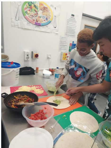
Healthy Eating and Lifestyle workshop