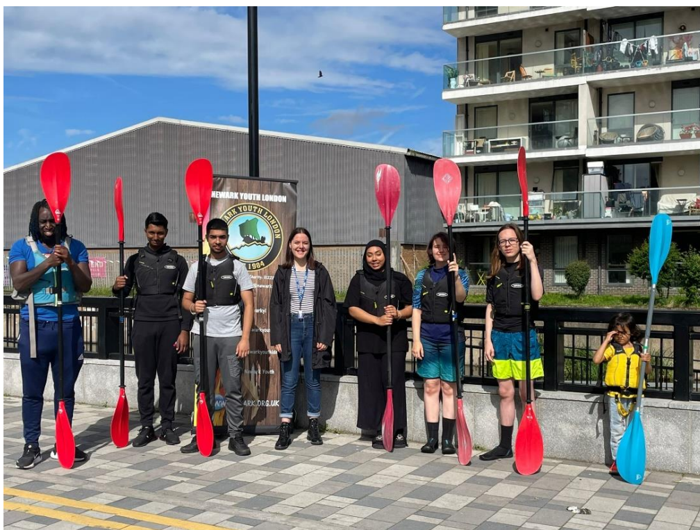
Back to Nature Call to Action Event

Directly in response to feedback from young people who wanted to reconnect with trees and open spaces after lockdown, we secured funding from City Bridge Trust to continue our Connect with Nature programme for a further 1 year starting in October 2022. In the first 6 months, we engaged 7 youth ambassadors onto the project, started delivering climate sustainability workshops in our youth centres and planned our first Call to Action event to get the whole community to come out to support climate cause.