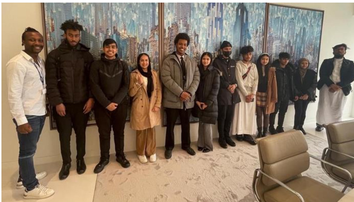
Young people on a visit to Canary Wharf Group

The project provided support to 56 young people in total and 32 young people gained accredited awards. 10 young people got the opportunity to volunteer to develop their skills and experience and 50 young people attended a careers fair, giving them access to employers and training providers. The participants experienced a visit to Canary Wharf Group in March 2023 to explore the working environment there.