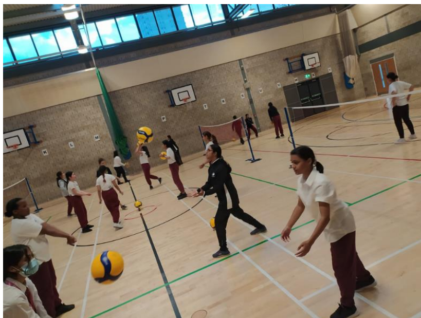
Volleyball at Mulberry School for Girls