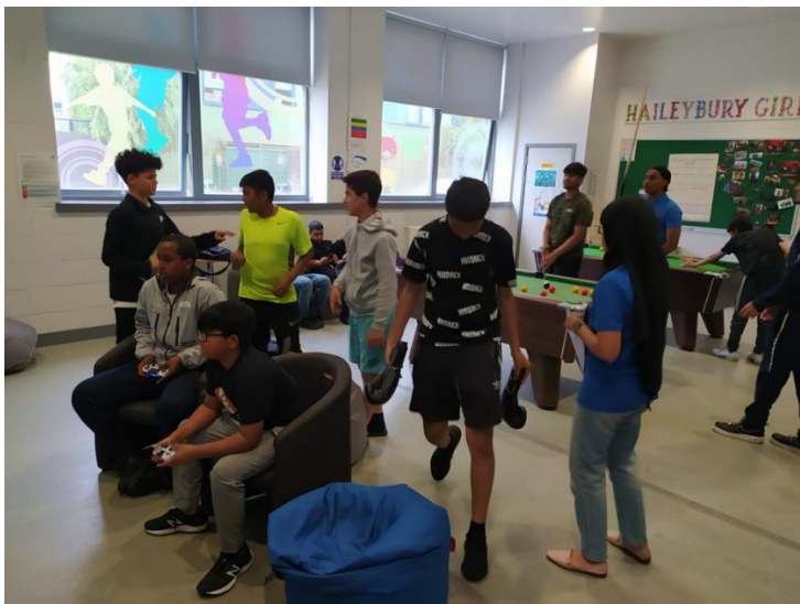
Socialising at Hailebury Youth Hub