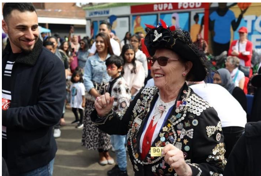
The Pearly Queen at the Jubilee Event