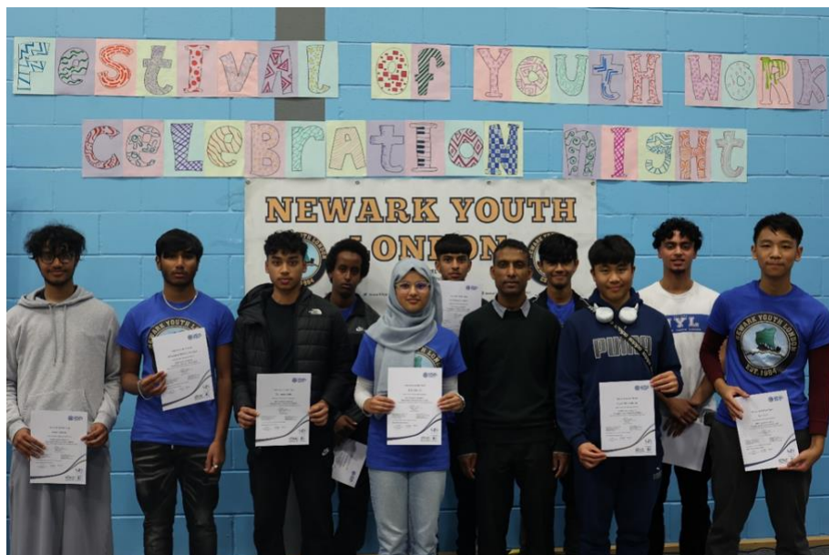
Youth Work Week celebration at Hailebury Youth Hub