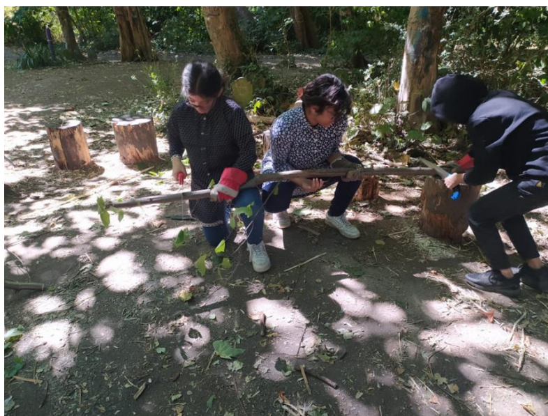
Practicing woodworking crafts and skills in Back to Nature

Young people in Tower Hamlets, who we work with, often have virtually no experience of the natural environment as they live in “concrete” urban areas and are often sceptical and uncomfortable about being in an environment where they are surrounded by nature. The 7 participants experienced a number of workshops, including Understanding the Ecological Crisis and Sustainability and Solutions, and explored what it might take to be an Environmental Ambassador. They will continue to learn and campaign for change as the programme progresses.