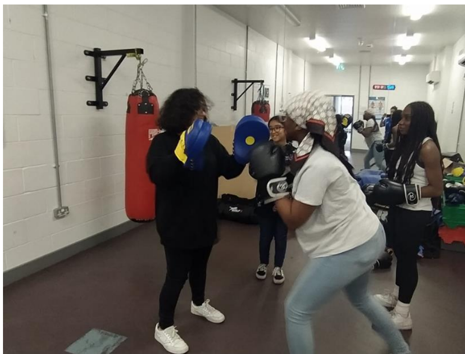
Boxing fitness session for females

This extensive programme saw a wide range of participants taking part in health and fitness activities, including 38 disabled people enjoying activities at Stepney Green Astro and 68 participants enjoying activities aimed at men. 19 girls enjoyed girls only football and more than 50 women enjoyed activities designed for over 50s and female only groups. Activities suited all ability levels, including 32 women who participated in the Stepney Women's Walking group.