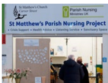
The stall within the Moor Market, St Matthews Parish Nursing Team, Sheffield

We were delighted to be championing parish nursing, and specifically our partner parish nursing services through social media platforms. The PNMUK social media footprint grew, mainly through Twitter, resulting in several fresh networking and awareness raising opportunities. PNMUK Keeping Connected on Facebook continued to offer a place for parish nurses to connect and share information and events, in a safe moderated space.