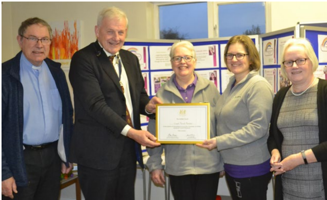
Capel Parish Nurses received an award from the High Sheriff of Suffolk: "In recognition of the Outstanding Service to the Community in Suffolk during the Covid-19 Pandemic".