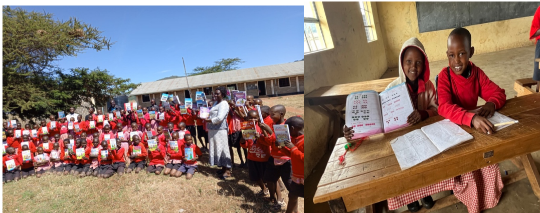
Receiving and using the new textbooks