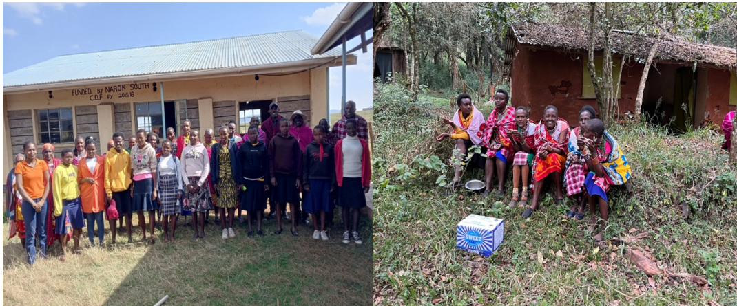
The scholarship children (left) Some of their mothers (right)

Within Orkonyil WT funded scholarships for 17 girls and 2 boys to go to secondary school. WT paid for two girls to go to university, one to study teacher training and the other nursing. Approximately £7,300 was spent on Orkonyil Scholarships.