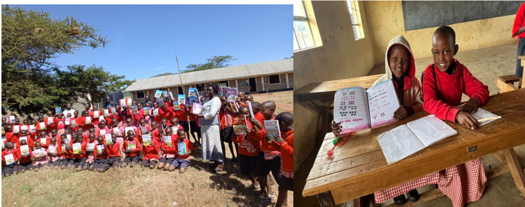
Receiving and using the new textbooks