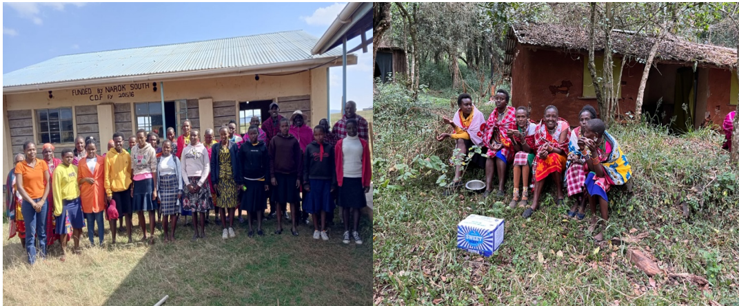
The scholarship children (left) Some of their mothers (right)

Within Orkonyil WT funded scholarships for 17 girls and 2 boys to go to secondary school. WT paid for two girls to go to university, one to study teacher training and the other nursing. Approximately £7,300 was spent on Orkonyil Scholarships.