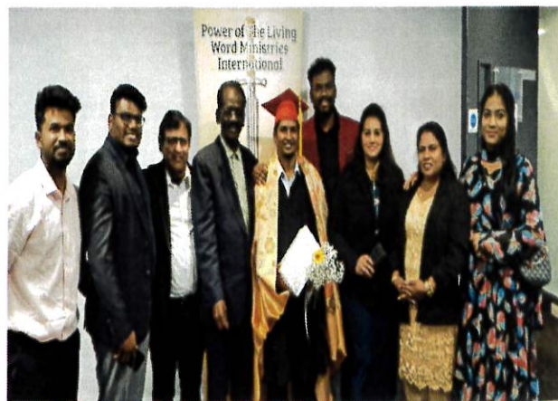
Our Indian family and friends