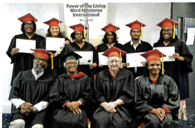
Principal, teachers and Graduates