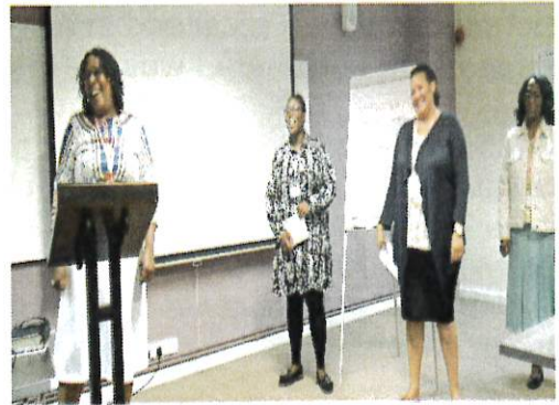
Ministers in Training