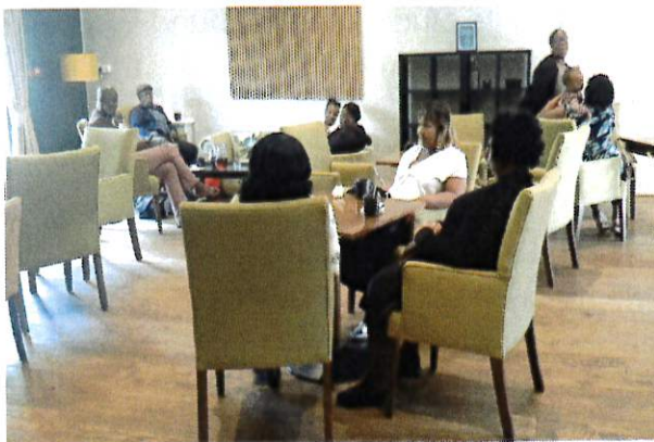
Relaxing at a tea break