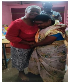
Comforting a Widow