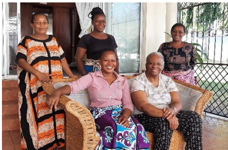
Christ Visitation Centre women