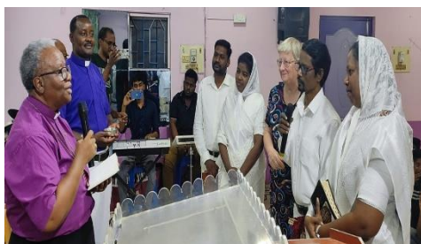
Praying for Church Leaders