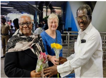
Happy you are here