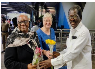
Happy you are here