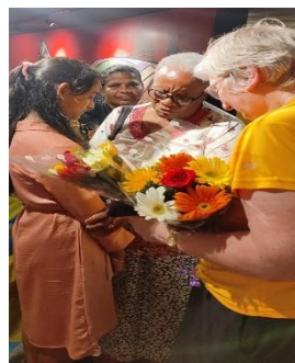
Praying for daughter