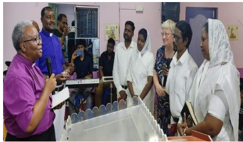
Praying for Church Leaders