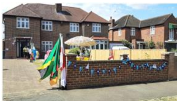
Ministry Mission Home

The Ministry contributed by bringing and sharing food from their heritage and we even sang National Anthems of the people represented including Italy, Jamaica and Great Britain