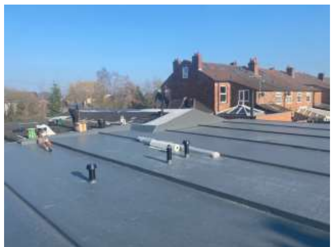
The roof being repaired