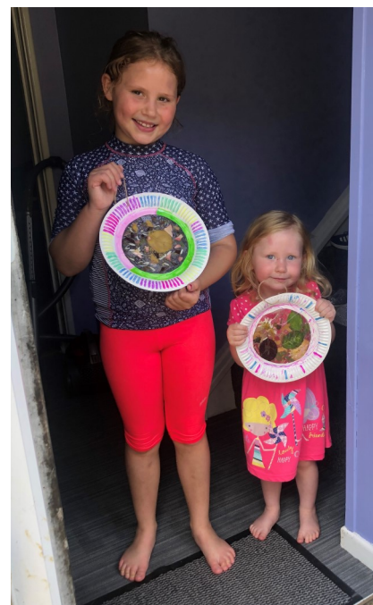
Children with suncatchers made from our activity packs, May 2020

We were unable to run our Reconnect Group during 2020, although we will be starting a new Group Project in 2021 (see Looking Ahead section).