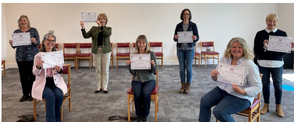
Volunteers receiving their end of course certificates in May 2021