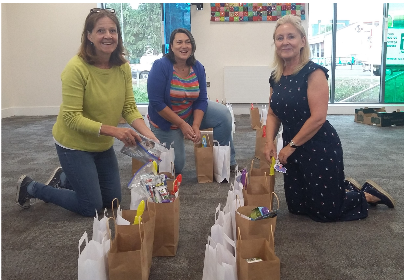
Above: Home-Start Cotswolds Coordinators preparing activity packs during lockdown, April 2020

Home-Start Cotswolds, c/o Cirencester Baptist Church, Chesterton Lane, Cirencester, Gloucestershire GL7 1YE