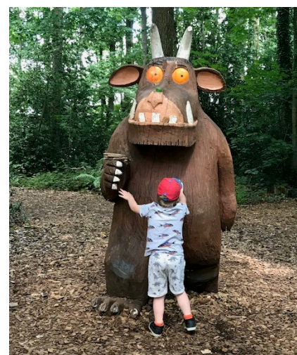
A child meets the Gruffalo at Westonbirt!