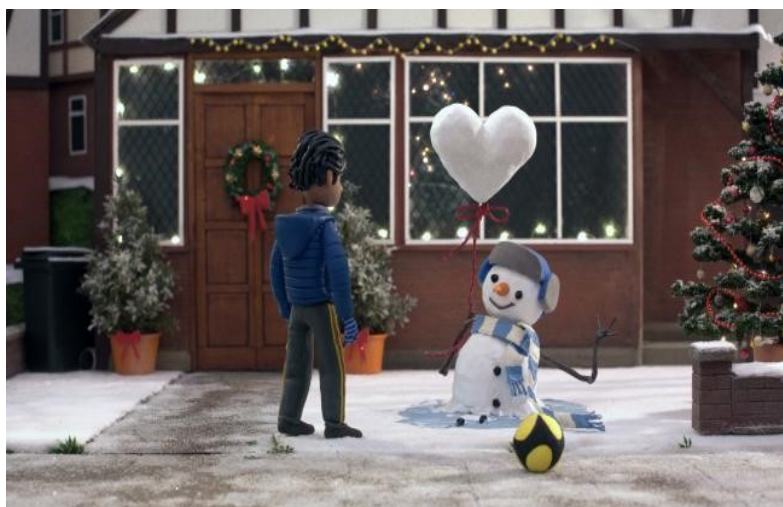
The John Lewis Partnership’s ‘Give a Little Love’ Christmas TV ad in support of Home-Start and food charity FareShare

We are fortunate to have the continued support of our funders, notably The John Armitage Trust, Peter Lang Children’s Trust and The National Lottery, who maintained their financial support during the crisis. In December, Home-Start was announced as a beneficiary of the John Lewis Partnership and Waitrose’s national campaign called ‘Give a Little Love’. We even had a mention in their renowned Christmas advertising campaign! This relationship is continuing in 2021. Then in September, another national retailer—White Stuff—announced a new three-year partnership with Home-Start across the UK. We hope that as shops open up again, we can continue to work closely with the Cirencester branch, which has been selling a range of products with proceeds donated to Home-Start.