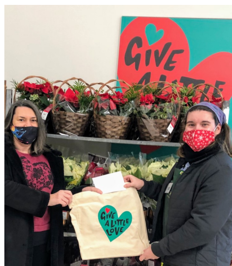
Receiving a cheque from Waitrose in December 2020

The Trustees acknowledge their responsibility to identify, assess and manage risks and ensure we take action as necessary. At this moment we are in unprecedented times and the situation is changing continually for individuals and organisations. The Trustees recognise that measures taken to contain Covid-19 will impact on our activities and our governance, including finances, and will act appropriately to safeguard our staff, volunteers and families.