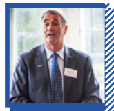
Nigel Mansell CBE Honorary President