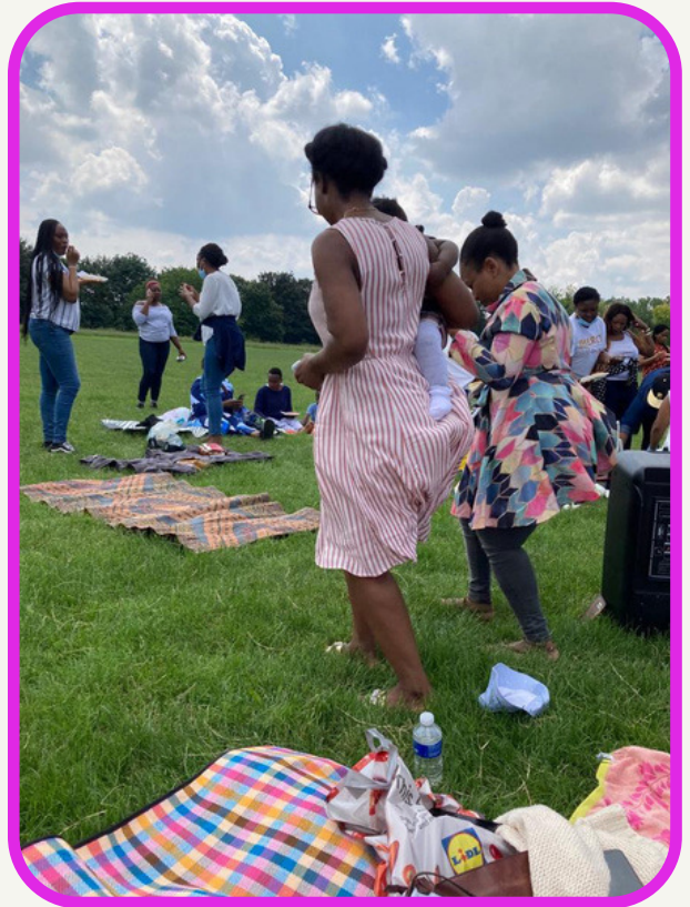
Community Park Picnic