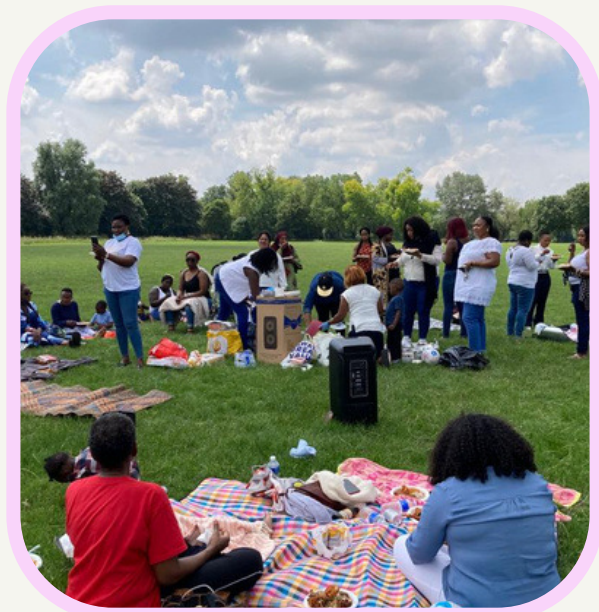
Community Park Picnic

Genesis impact have organised community events which have allowed us to not only support those who may have been affected by the increasing levels of loneliness and depression as a result of the pandemic, but also come together as a community to enjoy some time together.