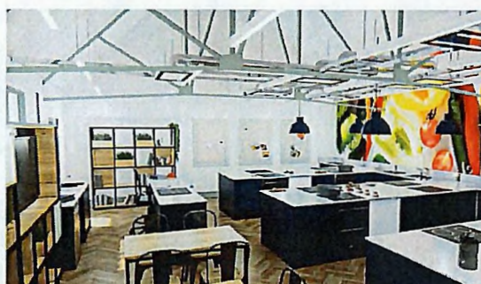
New Cookery Room