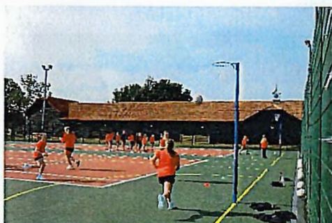
Resurfaced netball court