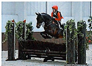
NSEA National Champion