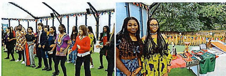
International Culture Day

The brainchild of a Sixth Form student, International Culture Day was conceived as a celebration of the diversity of pupils in the Preparatory Divisions at New Hall. This year's event involved students from across the Preparatory and Senior Divisions. Colourful interactive displays, created by students representing their cultural heritage, gave pupils an insight into a variety of traditions from China, Kenya, Iceland, Sri Lanka, India, New Zealand, The Netherlands, Slovakia, France, Spain, Italy and Belgium. Many pupils also dressed in clothing from countries around the world.