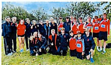
Cross Country Cup team