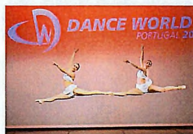
Students at the Dance World Cup

This year, 130 students participated in two large-scale drama productions: We Will Rock You and Grimm Tales (New Hall's first experience of promenade theatre). 340 students (the highest number to date) from Year 5 upwards have taken Trinity examinations in the following options; Speech and Drama, Acting Skills, Communication Skills, Performance Arts and Musical Theatre. There was a 100% pass rate and 95% of students achieved a distinction or merit grade. New Hall has also been awarded Trinity Champion Centre status for 2023 to 2024.