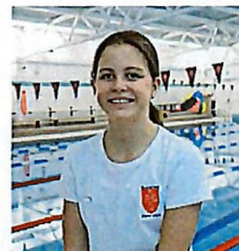
National Champion Gold in the 50m breaststroke