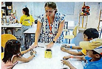
Community Fun Day