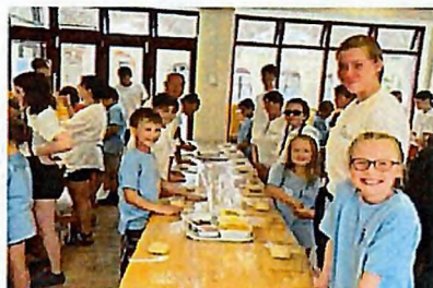
Little Edi Foundation

New Hall hosts a number of charity days including for the Little Edi Foundation and a Community Fun Day organised by the Canonesses of the Holy Sepulchre.