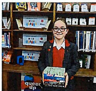
Top 8 in Wicked Writers competition