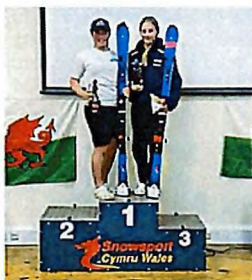
GBR Series Overall Indoor Champion 2023