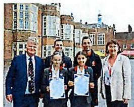
ISA Athletics National Record Holders