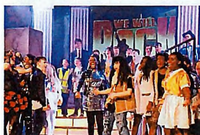
We Will Rock You