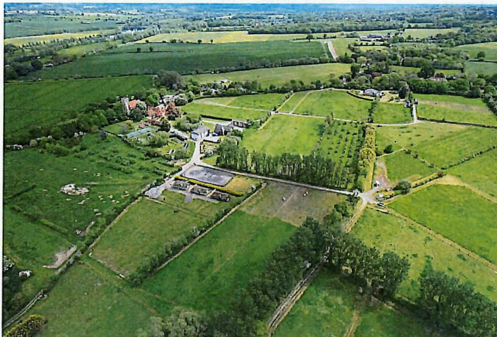
New Hall Park Farm