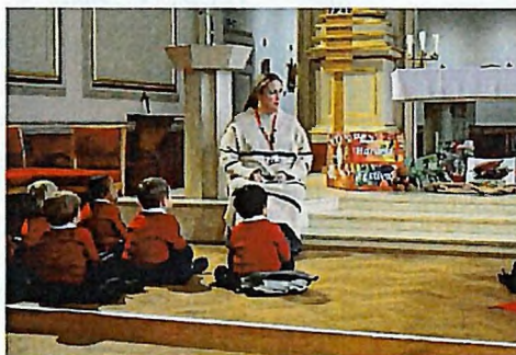
Pre-Prep Divisions' Harvest Festival