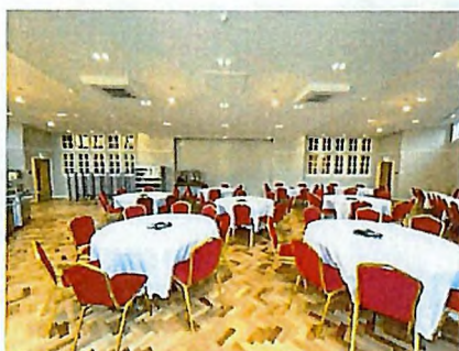
Year 7 & 8 Dining Room