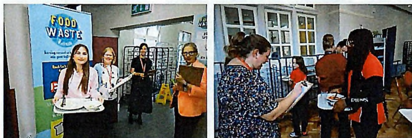
World Food Day – Eco Council

A focus for the School this year has been eco and sustainability. We are working towards a target of 'zero waste to landfill'. The School has adopted a recycling system, where all waste is collected and separated at a large recycling centre. This also includes food waste, which is collected in a newly installed facility, to be used for both bio-gas and fertiliser. The Year 12 Eco Council Leaders act as champions of ecology. The Eco Council contributes to plans and efforts to create a more sustainable and eco-friendly environment and community.