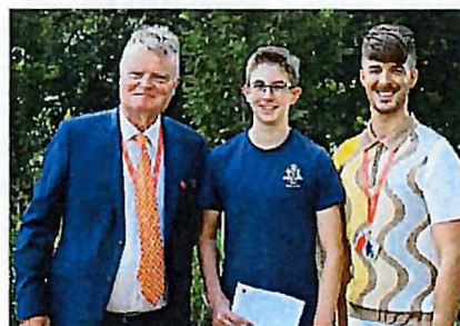
Year 10 EPQ full marks