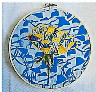
ISA Art finalist