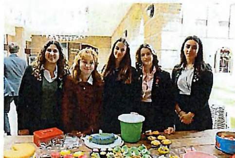
MacMillan Bake Sale

The students and staff of the School engage in a wide range of charitable work, including raising substantial funds for local, national and international charities. Charitable fundraising continued to have a high profile in School activities, supported by students, staff and parents. In 2022/23, funds were raised for a number of charities including: Macmillan Cancer Support, Brentwood Catholic Children's Society ("BCCS"), Mid & South Essex NHS Foundation Trust, Shoebox Appeal, Cancer Research, Great Ormond Street, The Mental Health Foundation, Chelmsford Food Bank, Kids Inspire, WWF Climate Crisis Fund, The Trussell Foodbank, CHES Homeless Shelter.