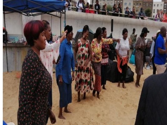
Trip to Margate