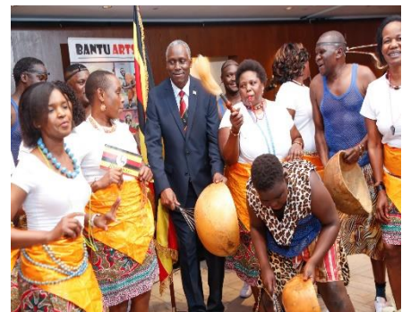
Uganda Independence Day Celebration