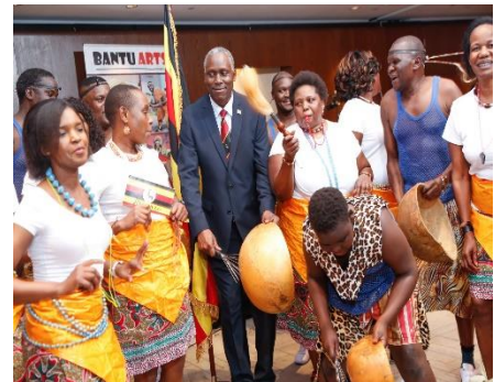
Uganda Independence Day Celebration