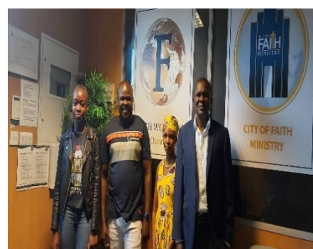
Romeo Odong studio performance