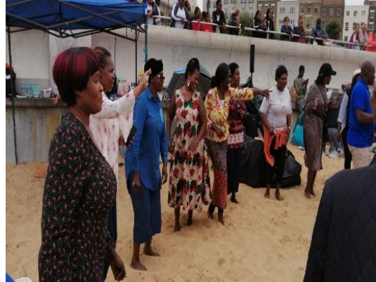
Trip to Margate