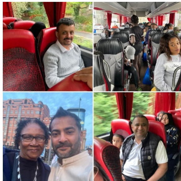
(Day out for Citizens and Families to Barmouth -July 2021)

During the summer of 2021, we arranged a day out to Barmouth Beach for citizens and their families including carers who really wanted to spend much needed family time at a beach to have fun, free from stressors and relaxation. 90 people including many senior citizens and carers attended this day trip.