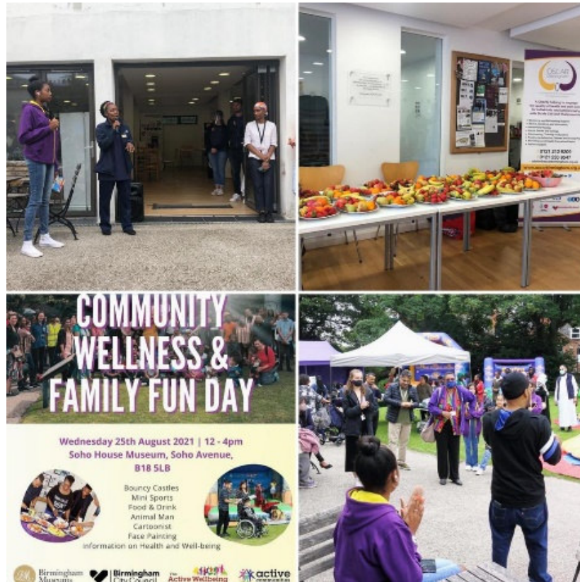
(Community Fun Day Event -August 2021)

We co-ordinated and led on a community wellness partnership event in August 2021. Organisations taking part included Birmingham Carer's Hub, The Active Well Being Society, NHS Birmingham Community Healthcare, Healthwatch Birmingham, The Food Justice Network, Birmingham Settlement and Ladywood Neighbourhood Network Scheme (NNS).