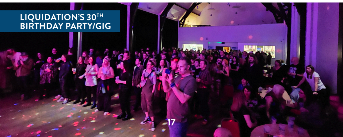
LIQUIDATION'S 30 TH BIRTHDAY PARTY/GIG