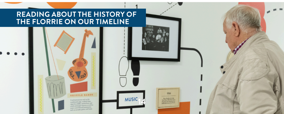
READING ABOUT THE HISTORY OF THE FLORRIE ON OUR TIMELINE