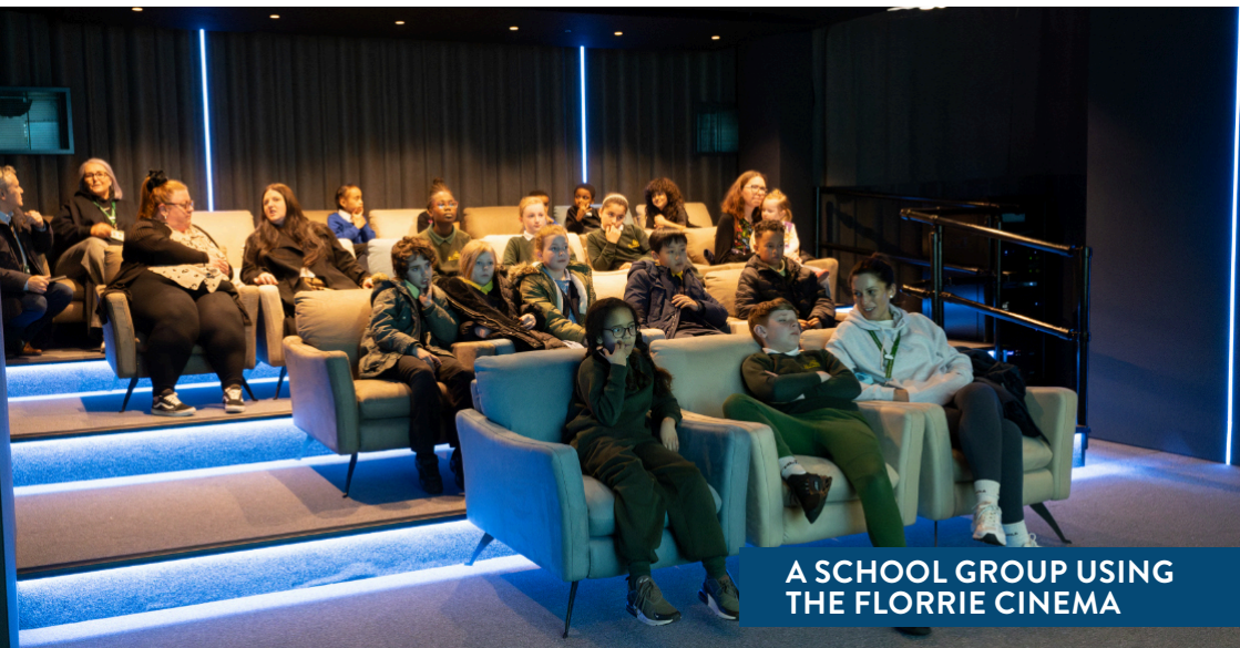
A SCHOOL GROUP USING THE FLORRIE CINEMA