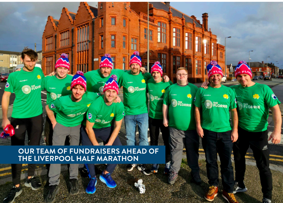
OUR TEAM OF FUNDRAISERS AHEAD OF THE LIVERPOOL HALF MARATHON