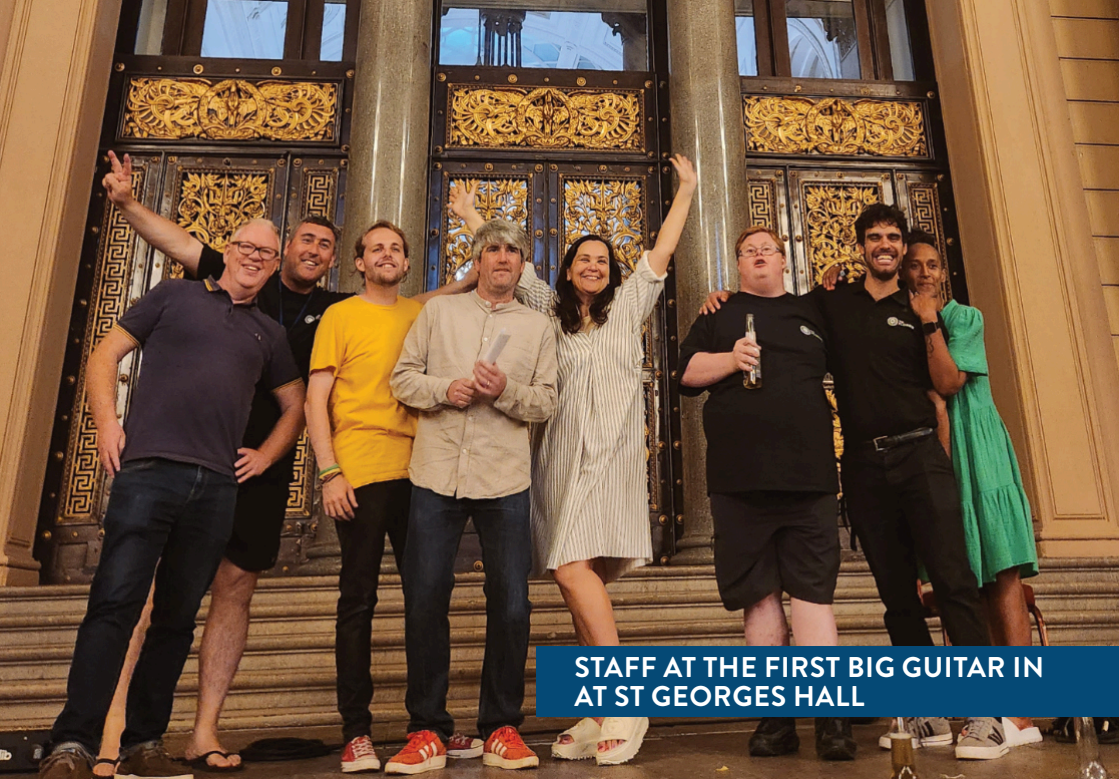
STAFF AT THE FIRST BIG GUITAR IN AT ST GEORGES HALL