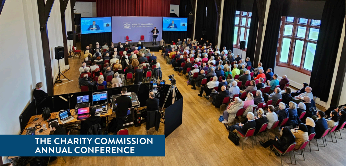
THE CHARITY COMMISSION ANNUAL CONFERENCE