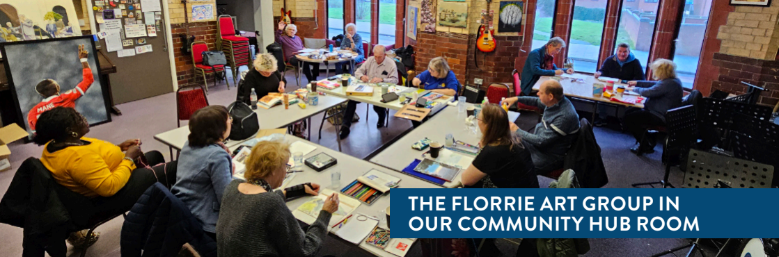
THE FLORRIE ART GROUP IN OUR COMMUNITY HUB ROOM