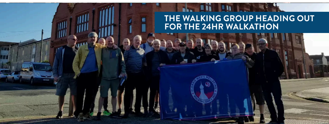
THE WALKING GROUP HEADING OUT FOR THE 24HR WALKATHON