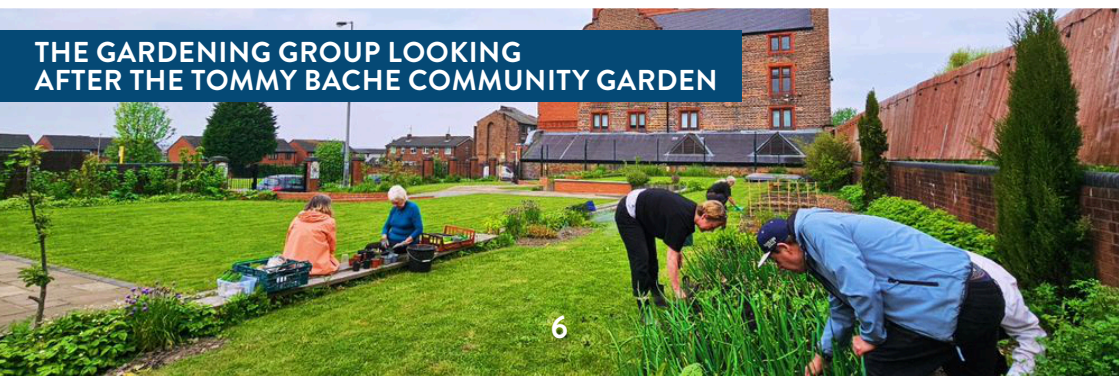
THE GARDENING GROUP LOOKING AFTER THE TOMMY BACHE COMMUNITY GARDEN