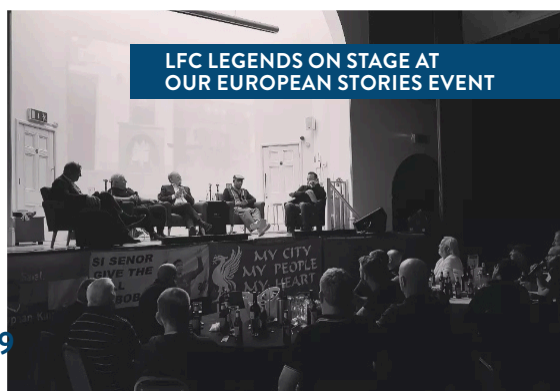
LFC LEGENDS ON STAGE AT OUR EUROPEAN STORIES EVENT