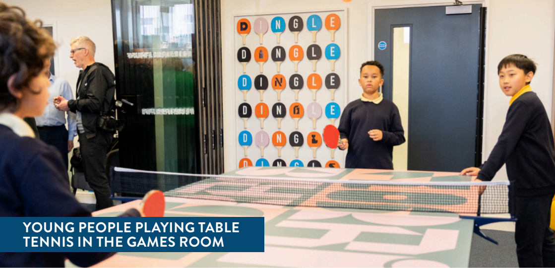
YOUNG PEOPLE PLAYING TABLE TENNIS IN THE GAMES ROOM