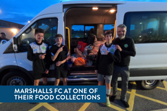
MARSHALLS FC AT ONE OF THEIR FOOD COLLECTIONS