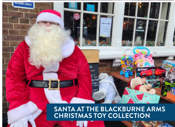
SANTA AT THE BLACKBURNE ARMS CHRISTMAS TOY COLLECTION