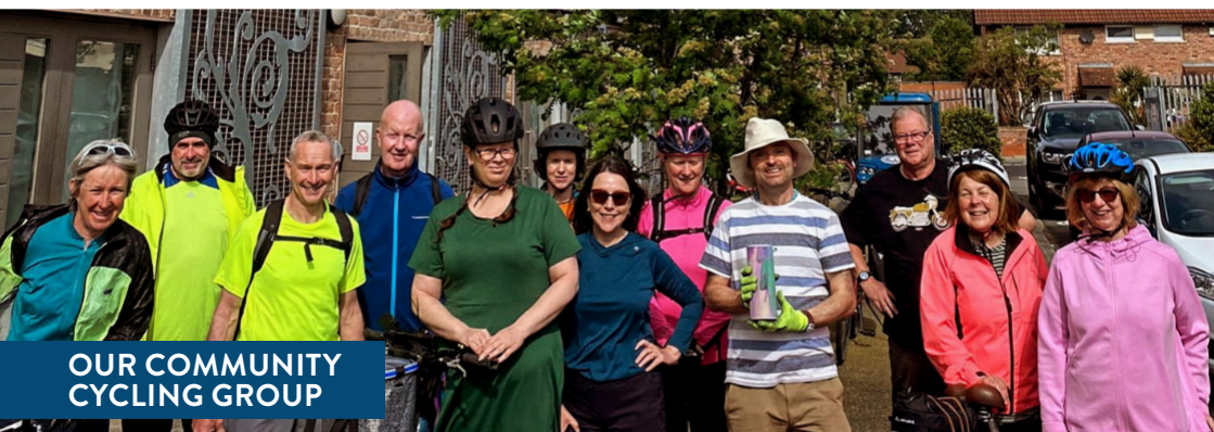
OUR COMMUNITY CYCLING GROUP