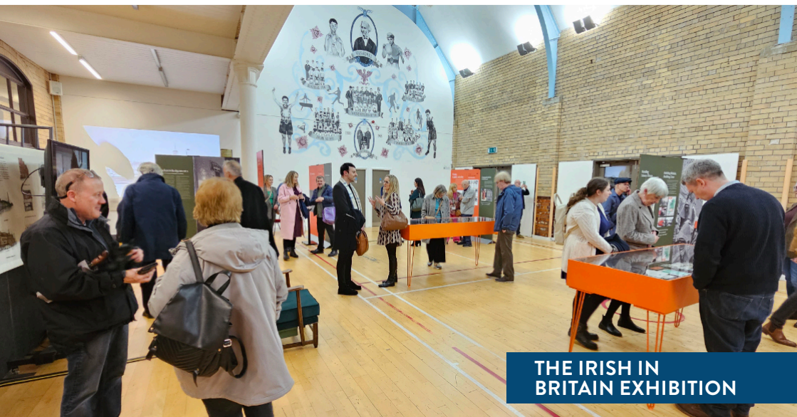
THE IRISH IN BRITAIN EXHIBITION