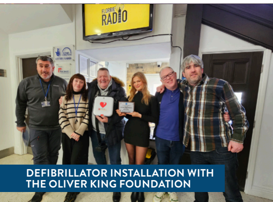
DEFIBRILLATOR INSTALLATION WITH THE OLIVER KING FOUNDATION