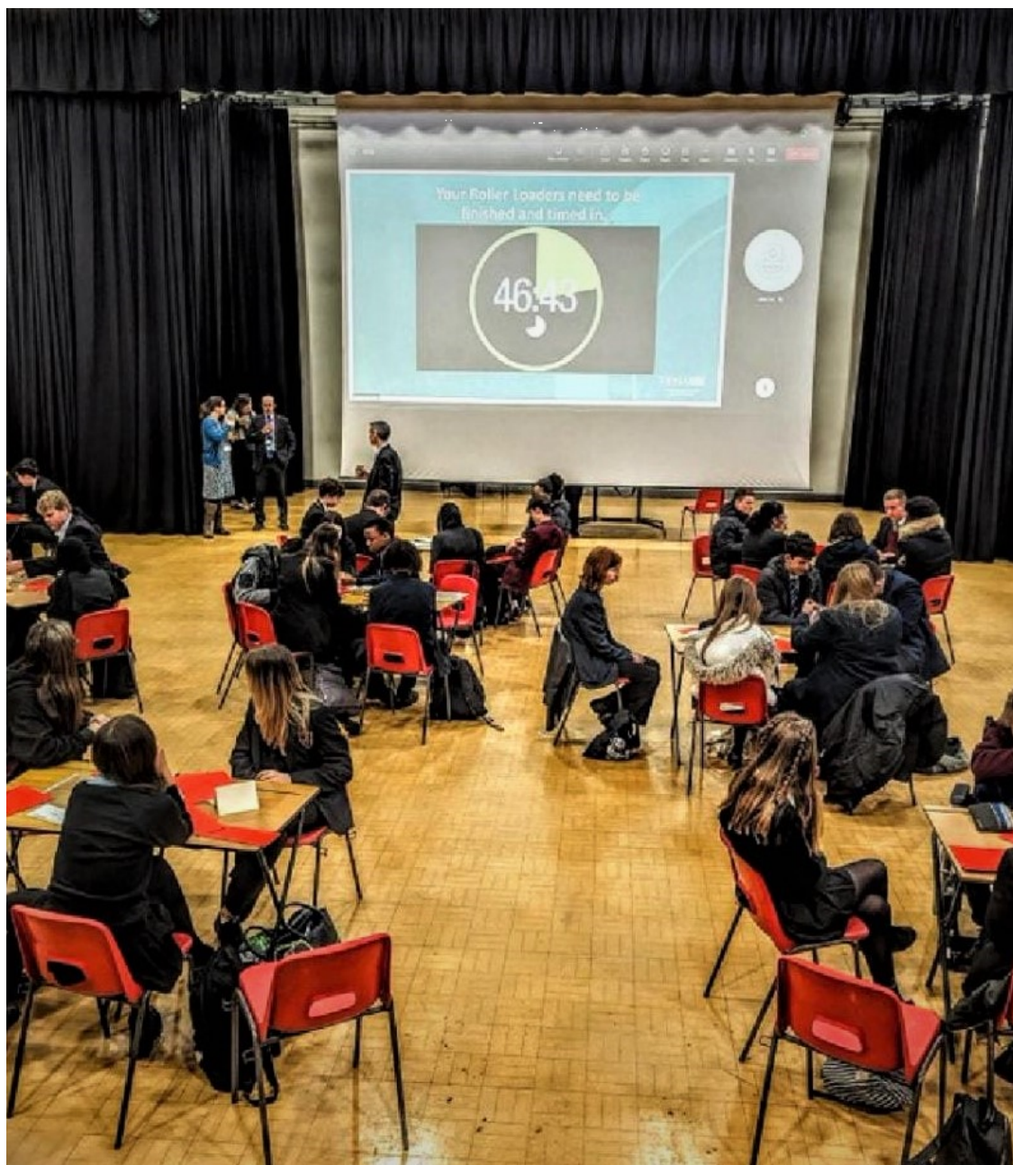
Students taking part in an engineering challenge, part of the Oxford Thinking project

The Foundation started the partnership four years ago and the real impact will be known in the next year when the first cohort of students will be starting University, but feedback on the programme from pupils, parents and schools has been very positive.