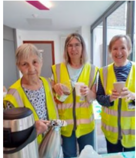
HOSPITALITY BOW FOODBANK

One Sister from the UK is a member of the Missionary Sisters of St Columban international “Care for our Common Home” team. The team encourages prayer and action worldwide on this vital issue. This has included writing letters, making videos, social media posts and promoting participation in the “ Laudato Si Action Platform ” (a global Catholic Church initiative to mobilize the entire Catholic Church around this issue). A few examples of activities that have been undertaken in our Area include: