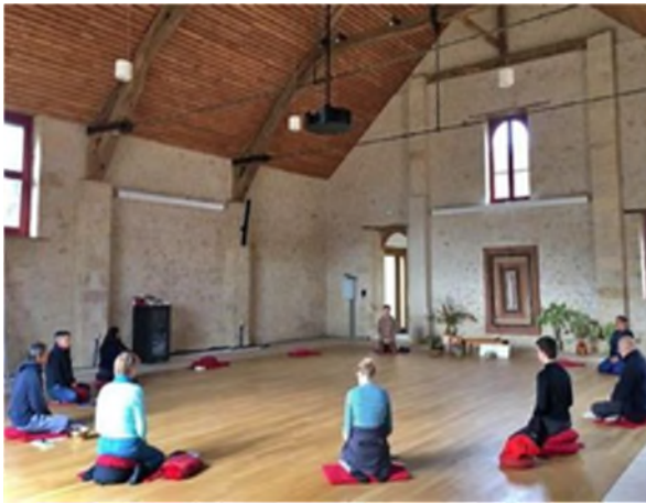
A meditation session with WCCM