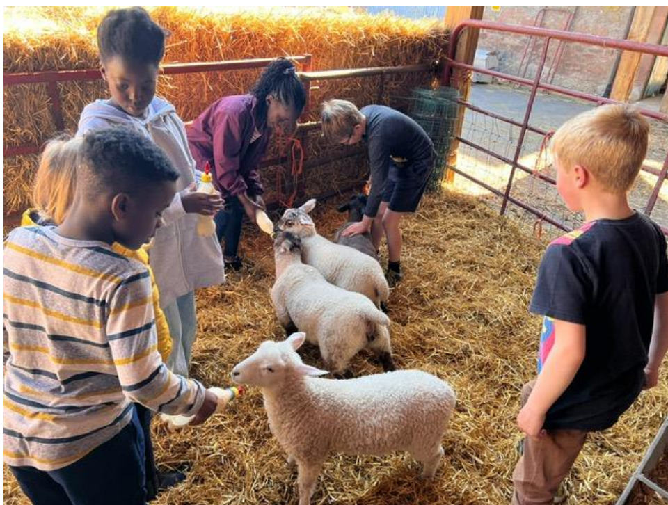
Descendants Children feeding lambs during Paxton house visit

message "What an inspiration the trip to Paxton house was. Thank you for the wonderful educational exposure My deepest gratitude for the amazing experience." Parent and son.