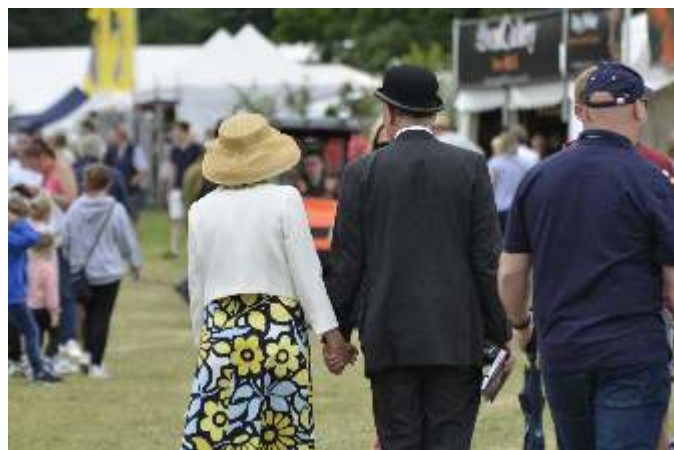
Even the Chairman managed to get some time to look around this year!

We also faced the additional challenges of a reduced field area for this year, and the decision by some members of the team not to participate this year, which we fully respected.