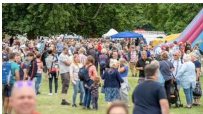
As one of the only agricultural shows held in 2021, people were very keen to attend and take part

Total attendance was around 6,000 but more importantly in this very difficult year, there is no doubt that it kept the spirit of the show alive. As the first event after lockdown and the only show this year in Lincolnshire it was enormously well-