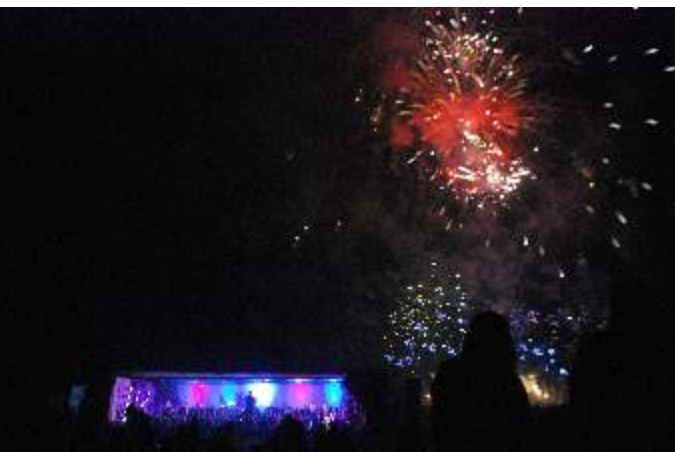
The firework concert with a Fleetwood Mac tribute band as the headline act was a great success, signifying the close of the one day show.