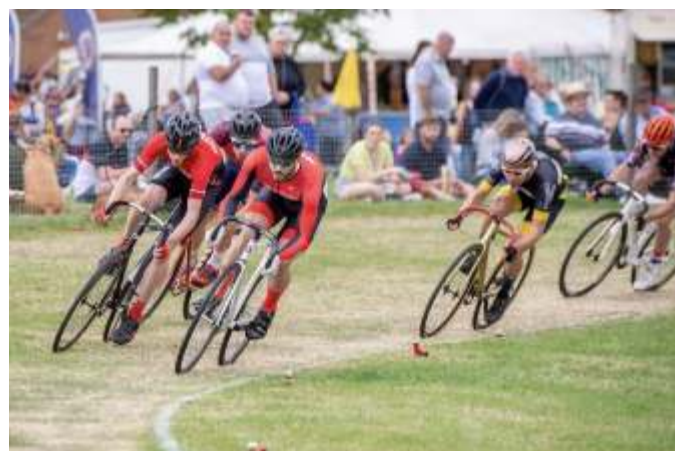
Grass track cycling was a key feature in the main ring this year and had very competitive entry

“Such a fab day out with my family and friends. We thoroughly enjoyed it from start to finish. Massive pat on the back to the team behind the show. You didn't let showgoers down, despite what must have been a really testing year from a planning (and everything else) point of view)! We just felt so happy to be out and about doing something 'normal'. Hope the 2022 event is back with an even bigger bang! Wholesome, family fun!