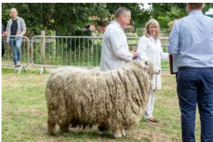
The Lincoln Longwool Sheep competitions were very well attended and once again we hosted their largest event in the county, supporting this rare breed.

“Thankyou for such a wonderful day! It was just what we needed! I looked around at the crowd of people , watching and dancing away to 'Fleetwood Mac' & thought, how proud the organisers of this wonderful show should be !