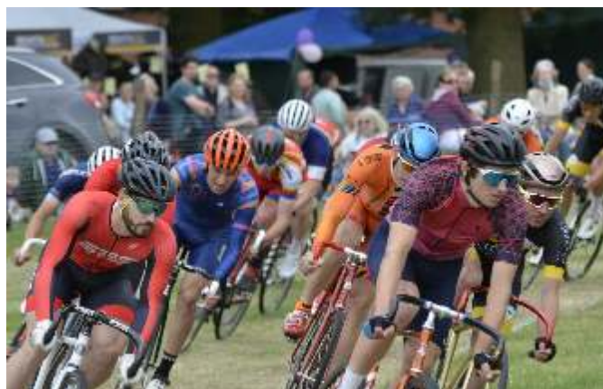
The cycling attracted many riders, being one of the few grass track cycling events held this year

As the country began to emerge from the various lockdowns triggered by the Covid 19 pandemic, it was clear that there was the possibility of having a show this year, although there were risks to manage, and complex and changing regulations to navigate. As soon as the government announced the Road Map for release from lockdown on 22nd February, we began looking at what was possible for 2021. It was clear that there was a strong