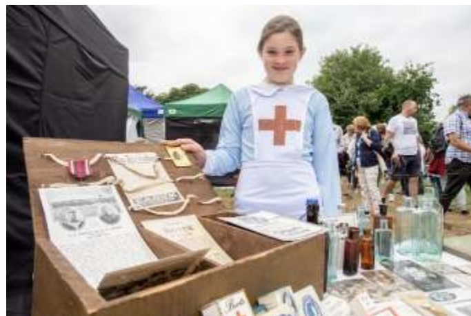
The Heritage Area had a new location this year close to the Hall gardens

“Just what we needed to raise our spirits. Such a tonic. Show was good. Fireworks were fab . Well done to all those volunteers who work so hard for the benefit of others. I, like many others really appreciate it...”