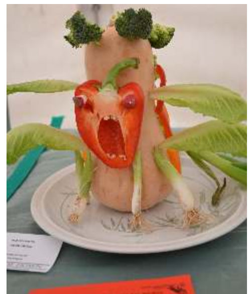
The horticulture tent had a reduced schedule, but entries were still of a high standard

The reserves are held at this level as a protective measure in case the costs incurred in preparation for a show are not met by income due to bad