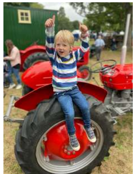
Vintage tractors were popular with visitors young and old!

“Even though it was only one day, so much was crammed in it was as if nothing had changed!”