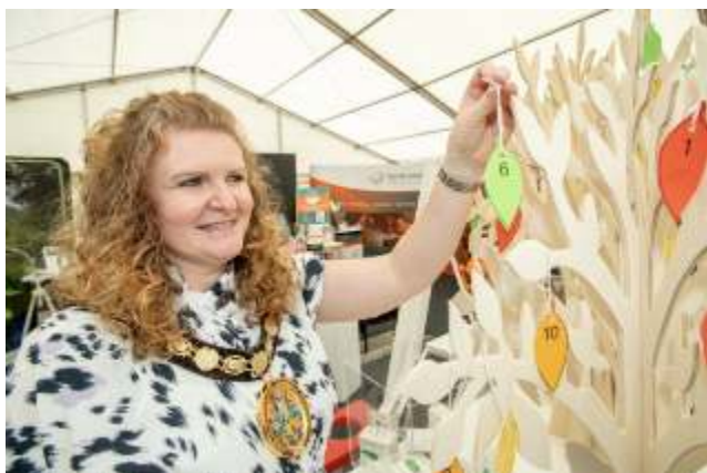
Chair of North Kesteven District Council visited the NKDC stand at the show which included a giant globe to highlight carbon reduction

“It was amazing, first time here and has such an enjoyable day. Thanks to all for all your hard work in putting on this great show. We will be back at the next one!”