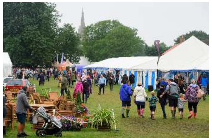
The show is an integral part of village life with friends and family coming to join in with the events and competitions

This report has been prepared in accordance with the Statement of Recommended Practice Accounting and Reporting by Charities (2015) and in accordance with the special provisions of part 15 of the Companies Act 2006 relating to small companies.