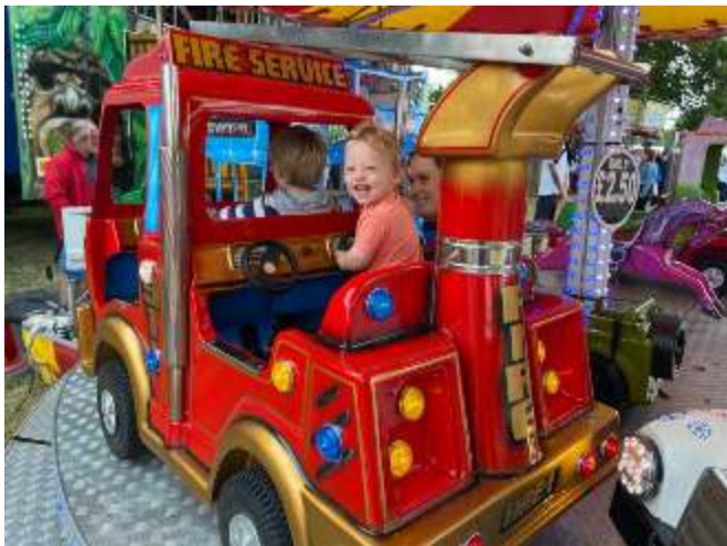
Families enjoyed being able to spend time together at the show.

As ever, we have had our sadnesses, losing some