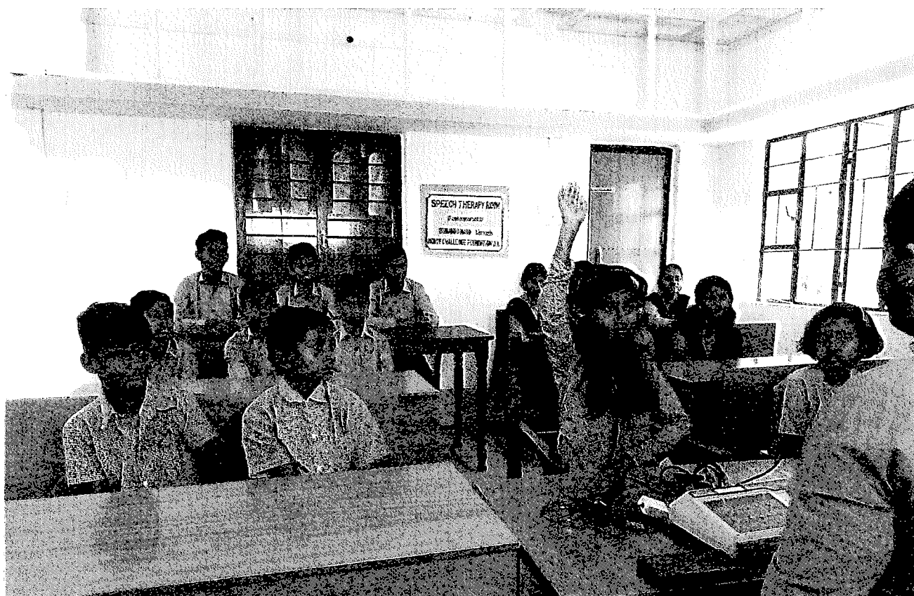
New classroom in Bikash school

In April 2021 Mondo provided a grant to Bikash special school in Bankura, West Bengal, allowing them to build an additional classroom to use as a speech therapy room. The room is used for pre-literacy classes for up to 20 children with learning difficulties. Bikash recently won a statewide prize from the Government of West Bengal for its work with under privileged communities.