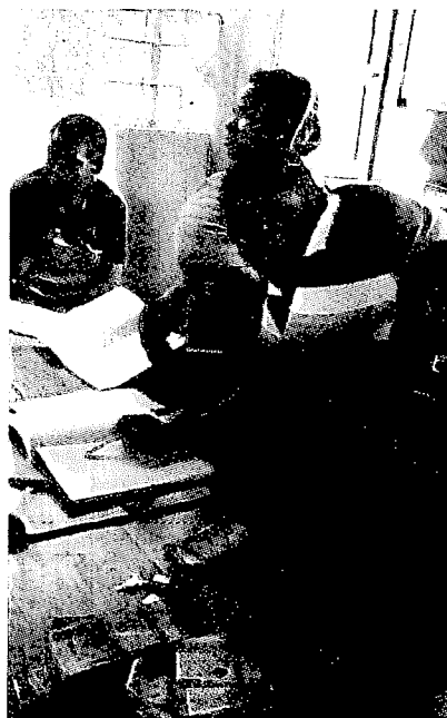
Right: Vicoba banking group