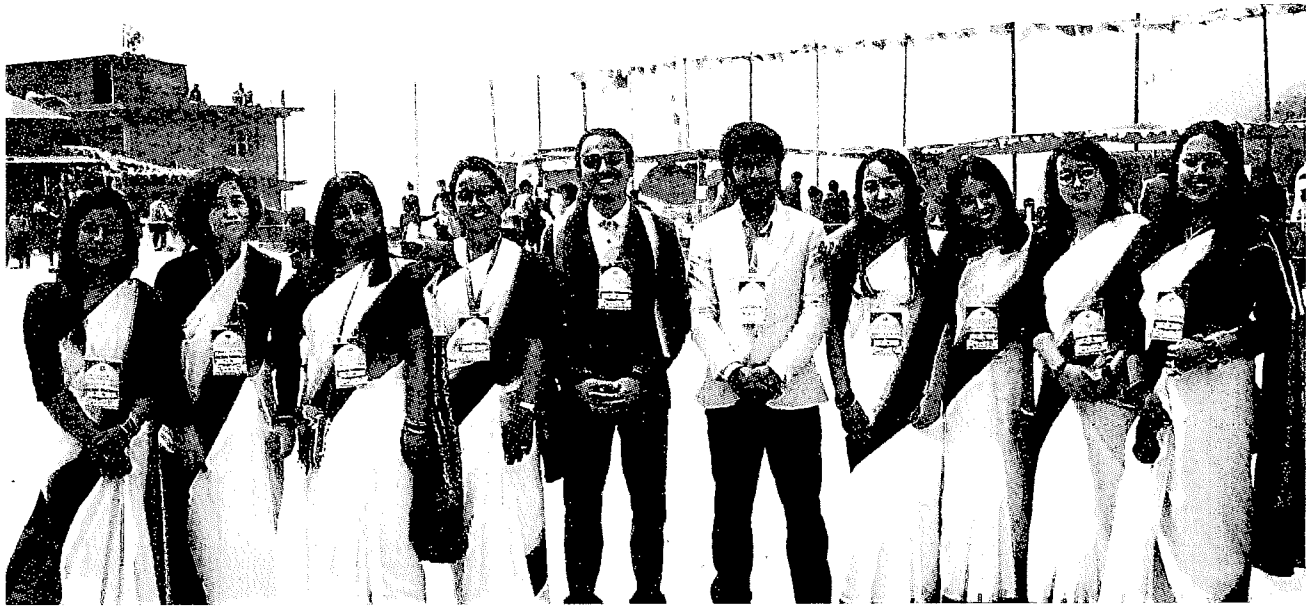
Above: First cohort of Saathi teachers at Learning Fair/ Below: distribution of solar lights during floods