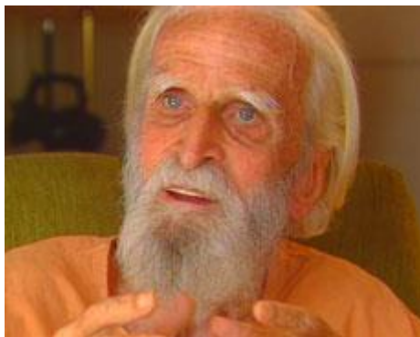
Fr Bede Griffiths