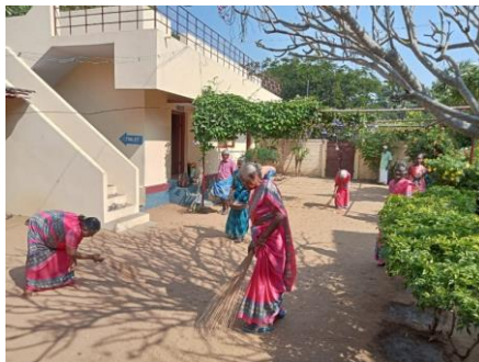
The Old People's Day Centre