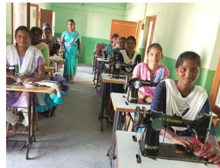
Training in tailoring

The cost of generating voluntary income was £76 and governance costs, for Trustees' insurance, were £303.