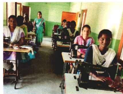
Training in tailoring

The cost of generating voluntary income was £64 and governance costs, for Trustees' insurance and conference software, were £367. Because the AGM was held online in 2022, no costs were associated with it.