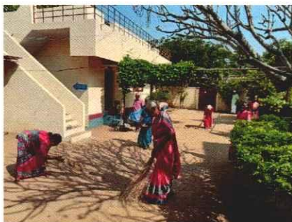
The Old People's Day Centre