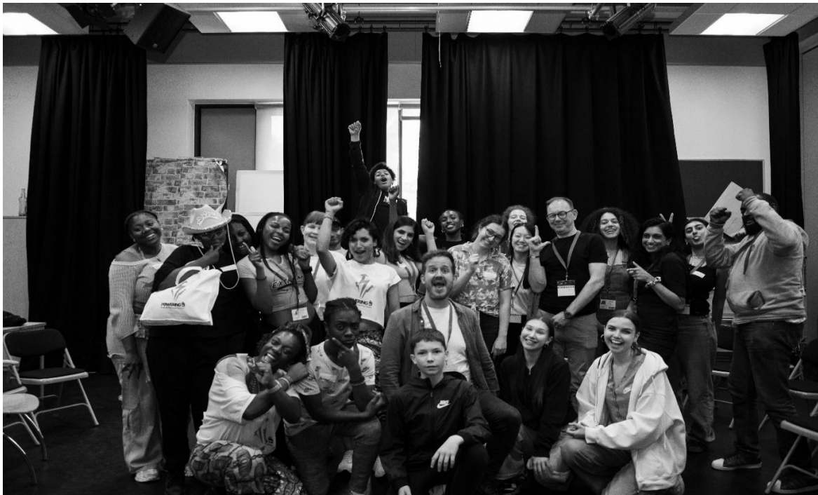
Powering Up – Show Up London

This is a snapshot of some of the projects we delivered that met our priorities