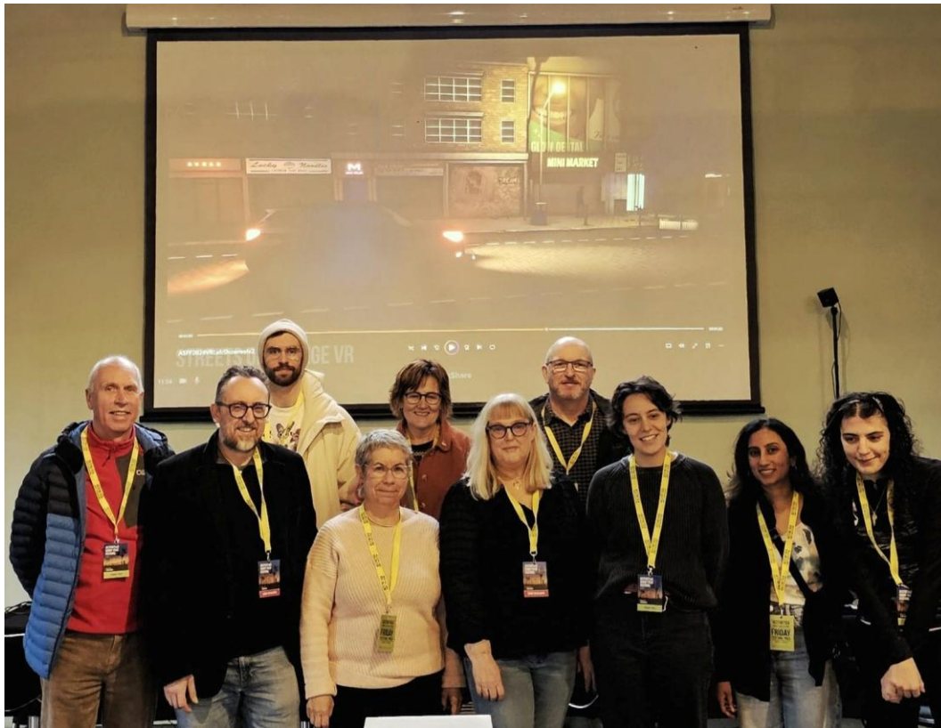
An important team day out at Aesthetica Film Festival

Our team and Board all game together in November at Aesthetica Film Festival to celebrate two games made with young people, Our Earth Your Choice and Play Your Way into Production being selected for the festival Games Lab, in addition our significant VR film Streets of Change about street homelessness was showcased in the VR Lab.