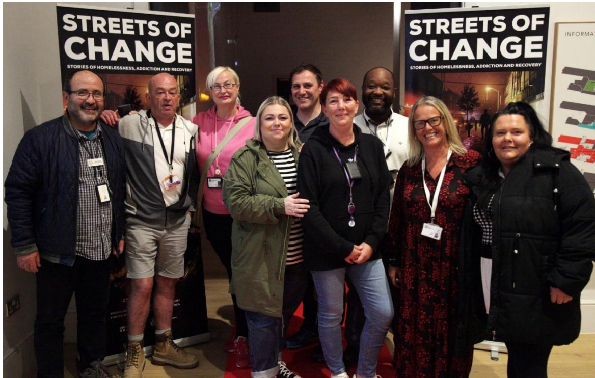
Some of the workers involved in the Streets of Change film at the launch night

Amid a worsening housing crisis in the UK, 'Streets of Change' a Virtual Reality experience and documentary film, in different ways, both expose the harsh reality of homelessness, where the average age of death is 46 for men and 42 for women. Streets of Change commissioned by West Northamptonshire Council launched in May 2024. The project has toured widely extensively since gaining great interest and traction helped by being featured on the BBC.