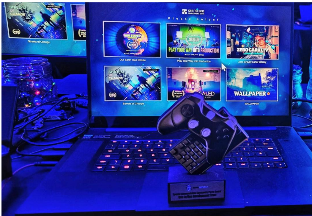
Our exhibition stand and award from GaMaYo

We were delighted that our work was recognised at GaMaYo largest ever games development event held at WX Wakefield where we were awarded a Special Commendation in the Community Player Award. This accolade was really important to our team in recognising our work in supporting young people in the industry.