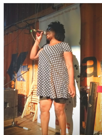
Conferences & Performances

2009 Linda Polan Trophy 2010 C&I Trust Services for the Wider Community 2014 Positive Practice in Mental Health Award (Diversity Category) 2021 UK Civic Arts Award Finalist