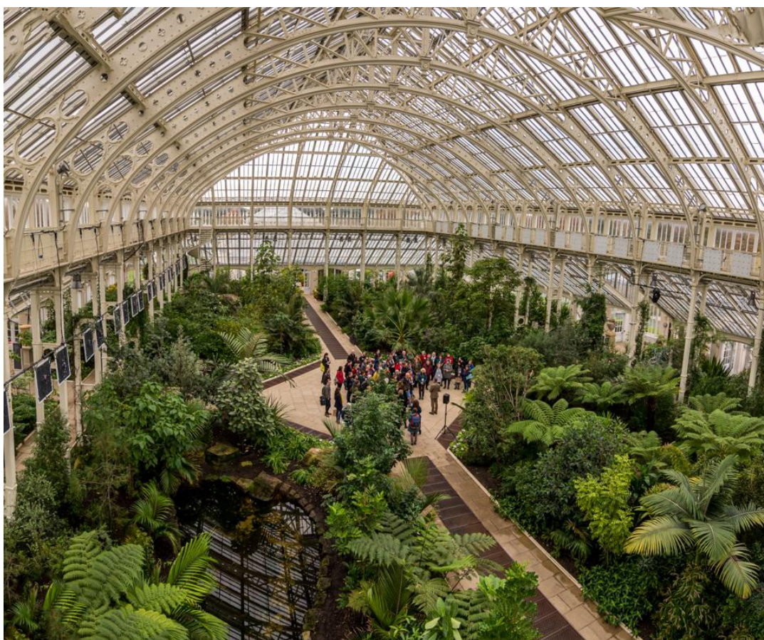
Photo: Bgen Conference 2019 at Royal Botanic Gardens Kew

Botanic Gardens Education Network c/o Museum No.1 Royal Botanic Gardens Kew Richmond TW9 3AB