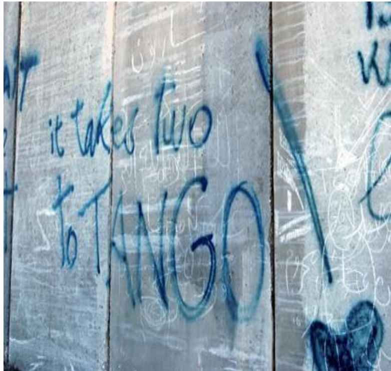
Graffiti on the Israel's so-called 'separation wall'.

Most BSST grants go to Palestinian, Jewish and joint groups, but currently we also support Golan Syrians, East Jerusalem gypsies, and African asylum seekers and migrant workers who now live in Israel.