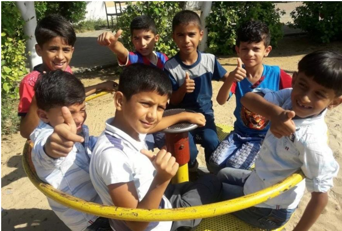
Children in Gaza in happier times: the summer camp run by Future Association for Development & the Environment

Our Jewish identity and commitment to a better future for all the people of Israel-Palestine-Golan is important to BSST, but not only to us. Often the groups we work with make it clear that, much as they value our grants, they equally value who we are and our aspirations for their lives in the years to come.