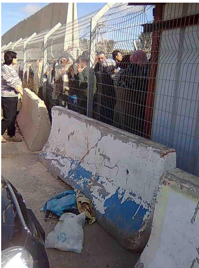
Machsom Watch monitor border crossings.

BSST itself has neither employees nor an office. Its volunteer trustees carry out all functions, working mostly online. This ensures that in a normal year, at least 98% of our expenditure goes on charitable grants. Unavoidable administrative overheads – bank charges, minimal postage and printing – usually make up just 1-2% of BSST's costs.