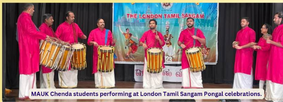
MAUK Chenda students performing at London Tamil Sangam Pongal celebrations.