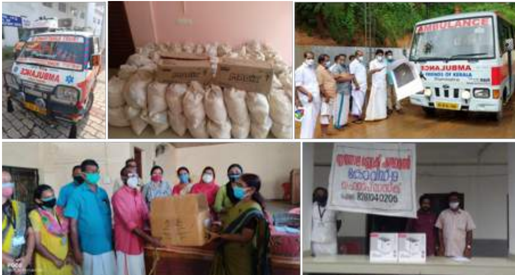
M.A.U.K. distributed face masks donated by Ford Dagenham Engine Plant.