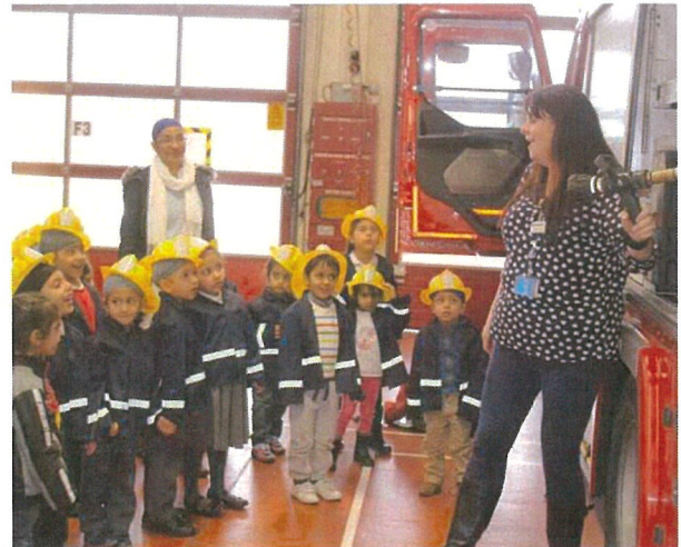
Kirtan class (l); Fire station event (r)