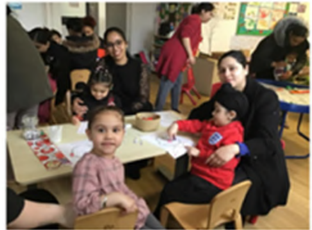
Nishkam Nursery Wolverhampton, Parent workshop, March 2023

The pay of senior staff is reviewed annually and normally increased in accordance with average earnings.