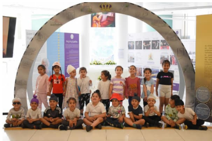
Nishkam Nursery Birmingham, Queens Jubilee, April 2022