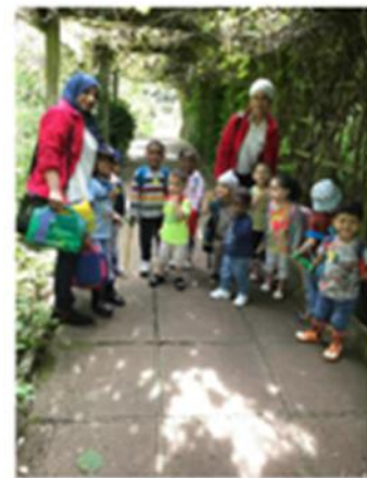
Nishkam Nursery, Trip to the Park, June 2022

The directors of the company are also charity trustees for the purposes of charity law and under the company's Articles are known as members of the Management Committee. Under the requirements of the Memorandum and Articles of Association the minimum and maximum members of the Management Committee shall be determined by the company in Annual General Meeting, but until so fixed there shall be no maximum number and the minimum number of members of the council shall be two. All member of the Management Committee give their time voluntarily and received no benefits from the charity.