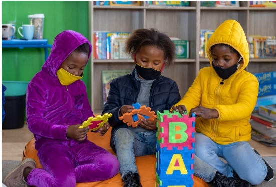
Young children playing and learning at Isaac Booi Literacy Centre