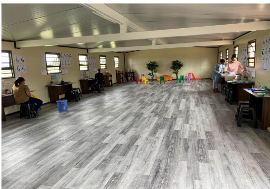
Inside the Literacy Centre at Astra – not fully complete yet