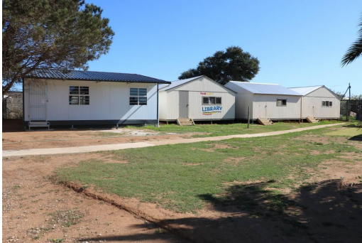
Literacy Facilities at Isaac Booi – a Library and 3 literacy centres