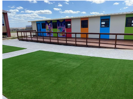
Literacy Centre and Library at Astra