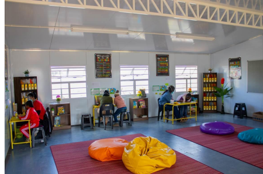
Inside a literacy centre at Isaac Booi