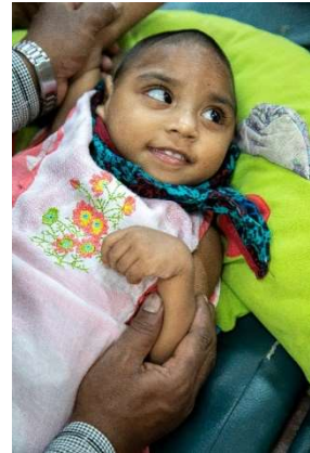
Physio in Rehab

How does LAMB benefit the people of Bangladesh?