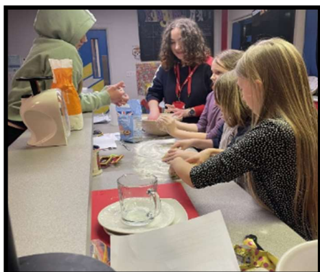
Cooking at the Bungalow