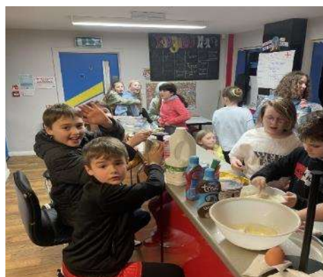
Cooking at the Bungalow