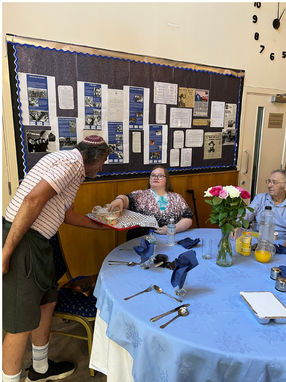
Enjoying a meal at the Thursday Club