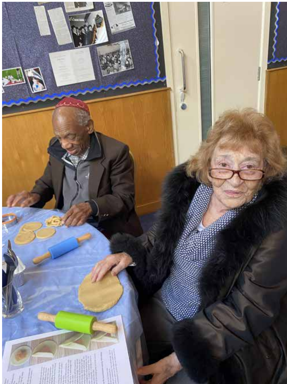
Enjoying the Thursday Club Baking Workshop