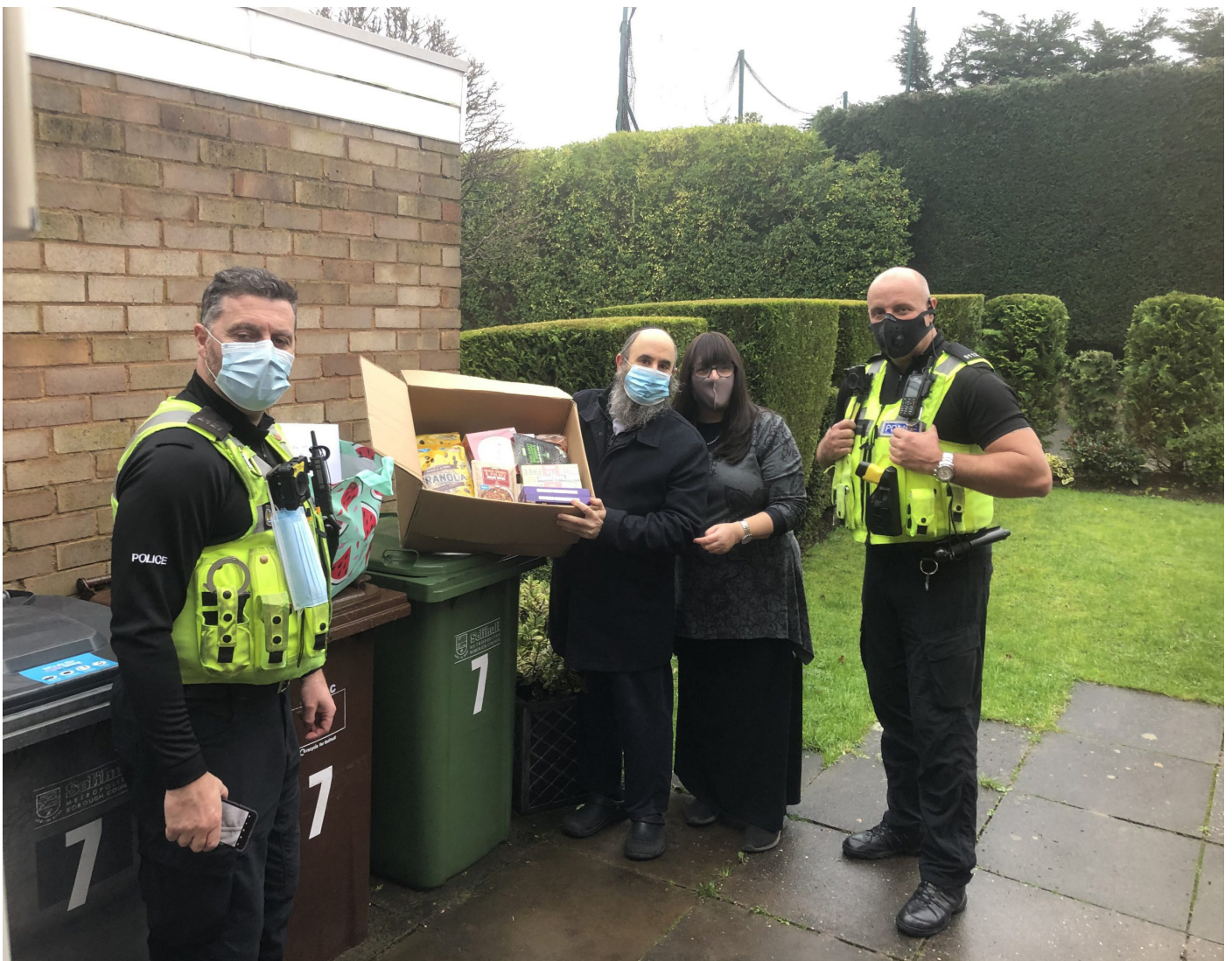
Representatives of West Midlands Police donating food from their staff collection to Solihull Hebrew Congregation Home but Not Alone project.